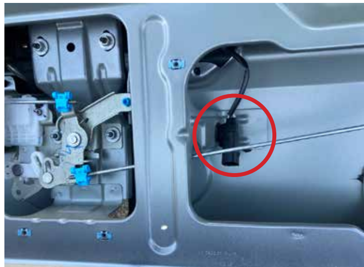
Power supply for rear brake light can be gained via the connection in the tailgate. No T harness supplied must be hardwired in.