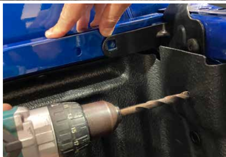
Create an access hole to unbolt the brackets. This method does not require the tub-liner to be removed.