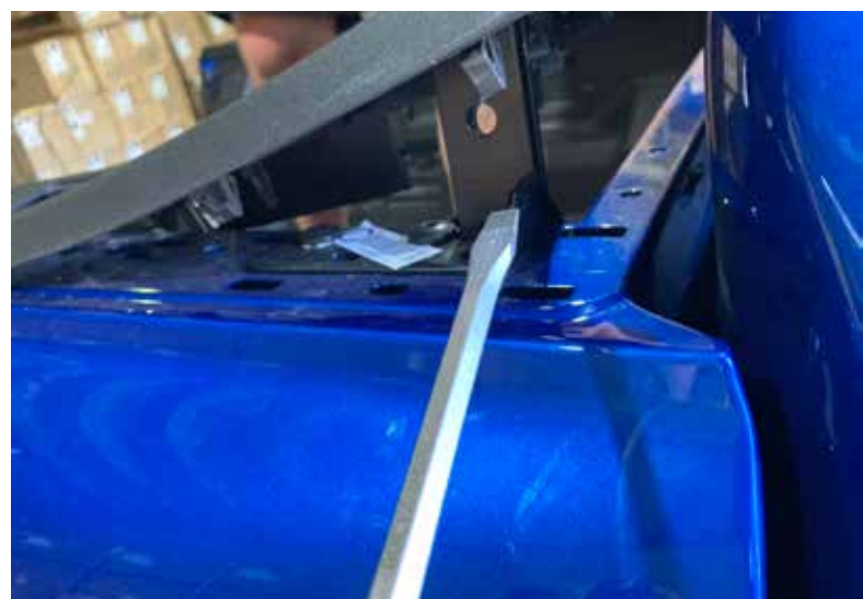
Using a lever or flat screw driver unclip the plastic tub rail exposing the bracket and bolts. Take care not to scratch the paint. Use a cloth as a buffer.