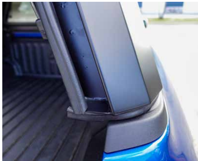
Reference photo for positioning of the canopy