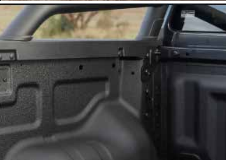
Un-bolt and remove the sports bar. This will leave the mounting brackets still attached to the tub.