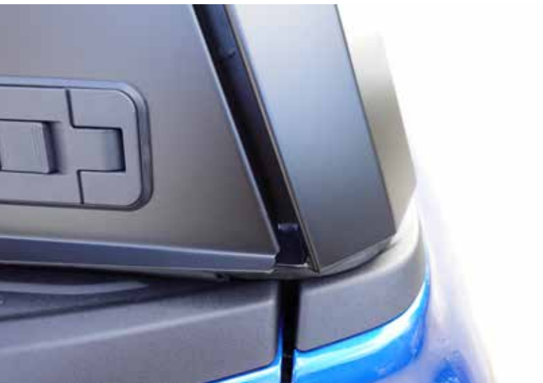
Reference photo for positioning of the canopy