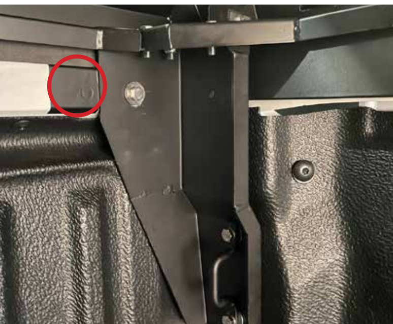
Use tape to seal factory holes in the tub.