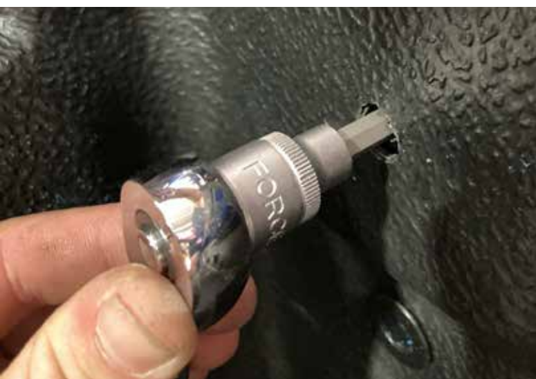
Using the access hole remove the bolts from the brackets.