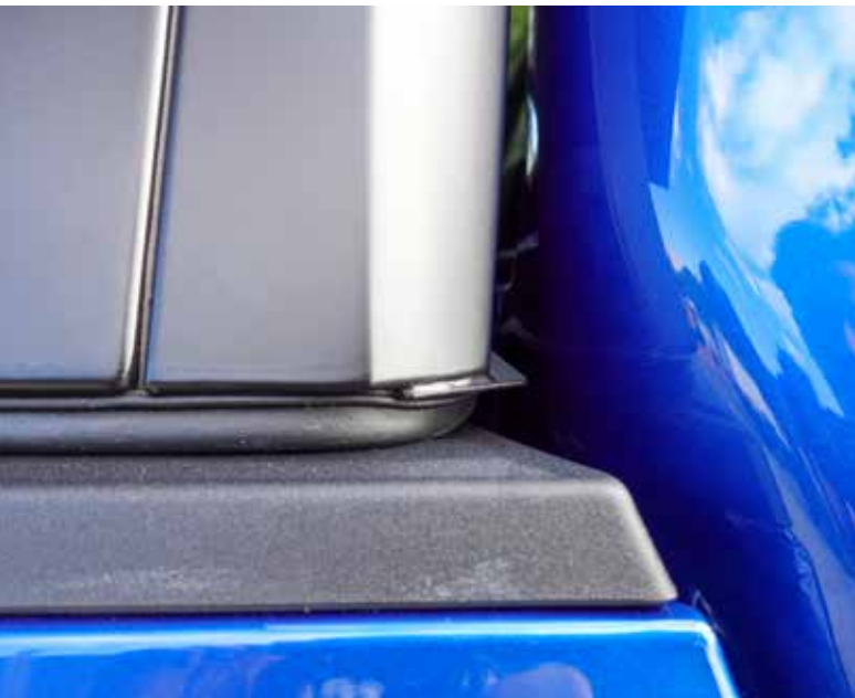
Reference photo for positioning of the canopy