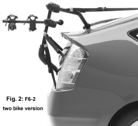
Fig. 2: F6-2 two bike version

The F6 Expedition comes to you fully pre-assembled in the box. Included with the two-bike version are six rubber straps; there are nine rubber straps included with the 3-bike version.