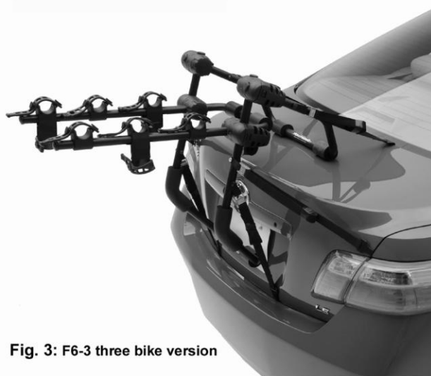
Fig. 3: F6-3 three bike version