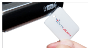
Optional 2-factor RFID Authentication

Optional 2-factor authentication utilizes a RFID tag in addition to your password for added protection.