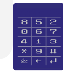
Rotating Keypad (To Prevent Surface Analysis)