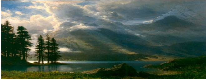
(Albert Bierstadt 'Scenery in the Grand Tetons')

American "Hudson River School" artists, especially Albert Bierstadt (1830-1902.)