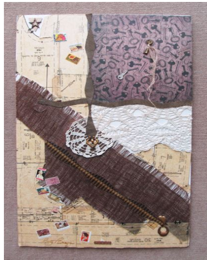
An abstract collage by Betty Bangs