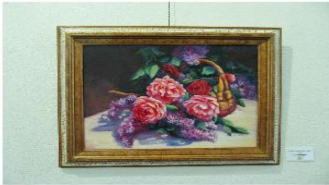
BEAUTIFUL FLOWERS FROM JUDY CALDWELL