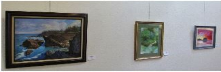
CHARLES EDMUNDS LEADS THE PARADE