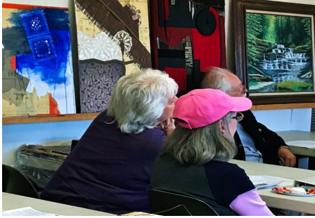
WAITING IN THE WINGS