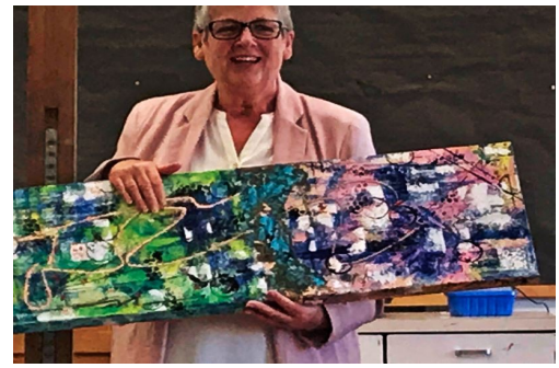
OUR PRESIDENT, AND HOST FOR THE SHOW-AND-TELL, SHARES HER ABSTRACTION