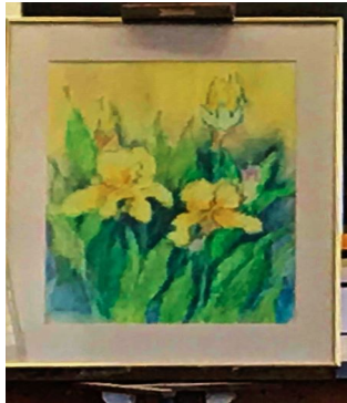
PASTEL BY ALICE ELLIS