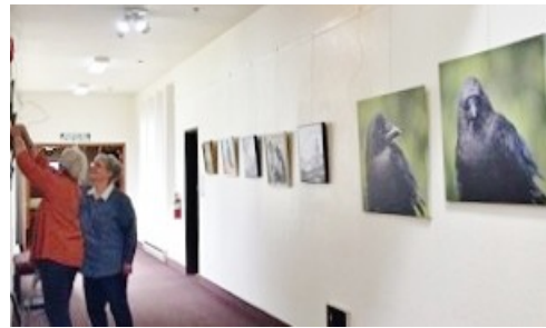
P.S. – SOME PHOTOS FROM THE JULY 14 RECEPTION