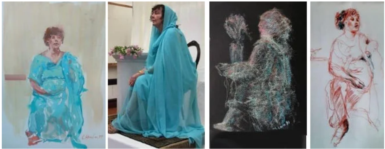
Figure Drawing Workshop