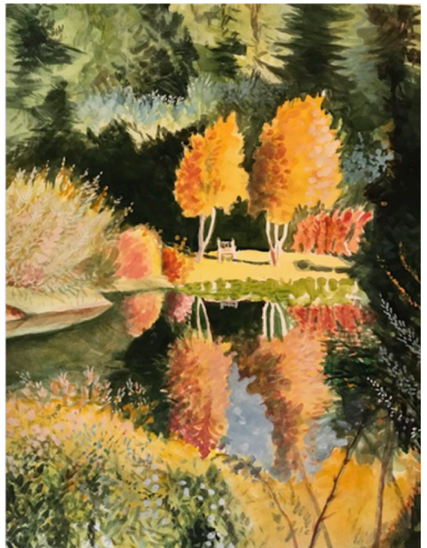
“FALL FOLIAGE REFLECTED IN THE WASHBURN'S POND” – watercolor by Victoria Tierney – October 2020 plein-air