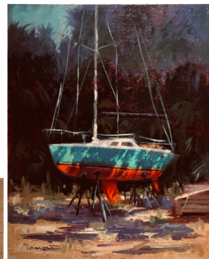
Fixer Upper , oil by Manon Sander