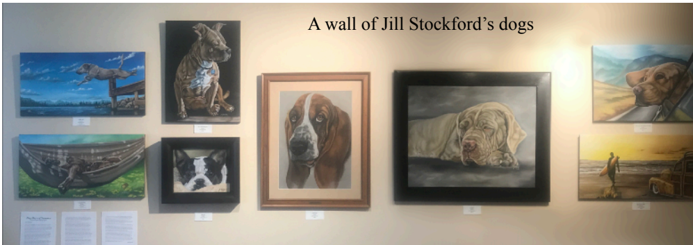
A wall of Jill Stockford’s dogs