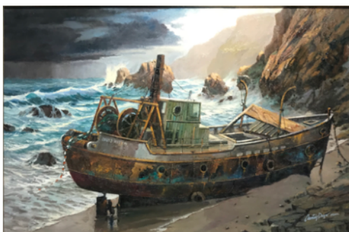
Opus 5 Rhythm , oil by Austin Dwyer (one of the jurors)