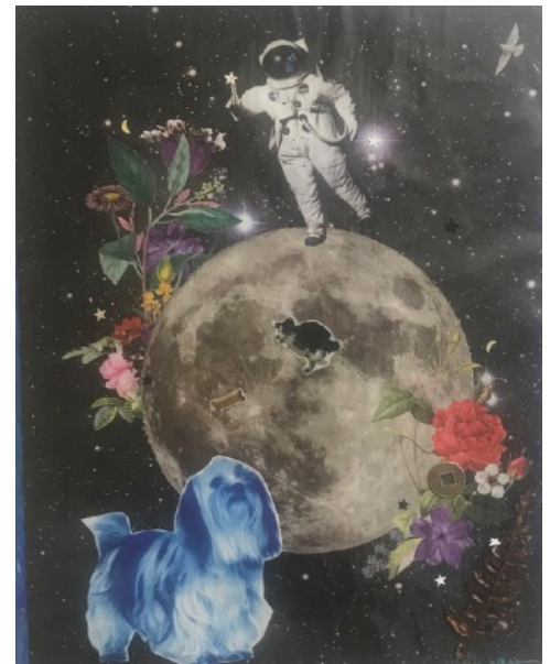
Dog Dream, collage by Carol Waxham