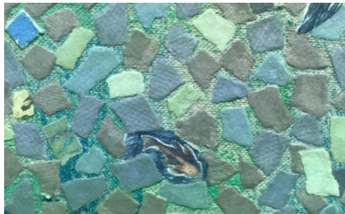
Deep Waters , detail