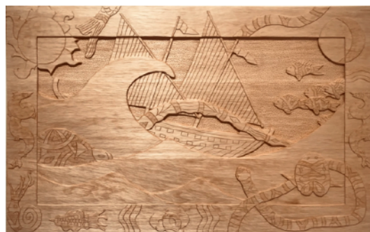
East of the Sun, West of the Moon, and Under the Sea , carved basswood by Alex Zenzuni