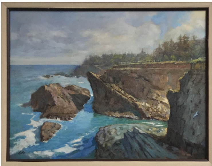
Low Tide Shore Acres, oil by Charles of Charleston, won Best of Show

Pat Snyder , our experienced and knowledgeable judge, spent several hours looking at each artist's work multiple times. It was quite a task since we were awarding ribbons in each of the media categories and dividing them between advanced and novice artists. Pat chose Charles Edmunds' "Low Tide at Shore Acres" as Best of Show, stating that this work "showed all elements of art in action (color, value, texture, space, line and shapes)". Angles in the composition direct the view's gaze into the core of the painting. There is an excellent use of colors and values, and the painting shows mastery of materials.