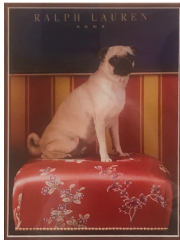
New York City Granddog Models for Ralph Lauren