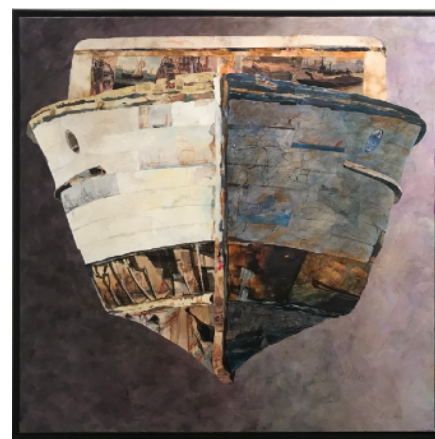
Spirits of the Sea , acrylic/collage by Pat Snyder, won the Port of Coos Bay award