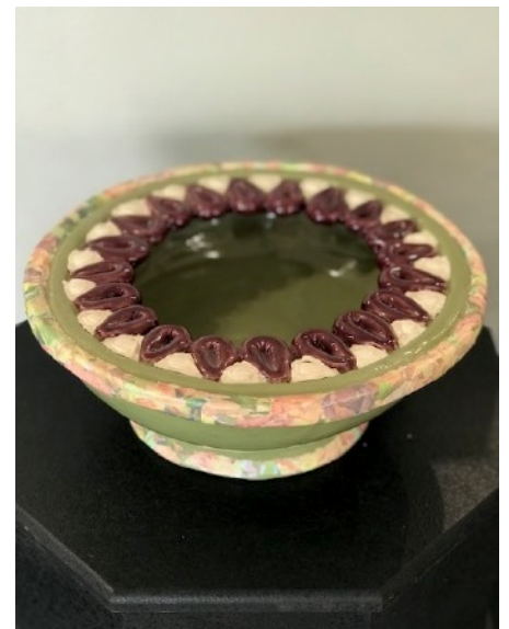
Pottery by Valerie Meeuwssen