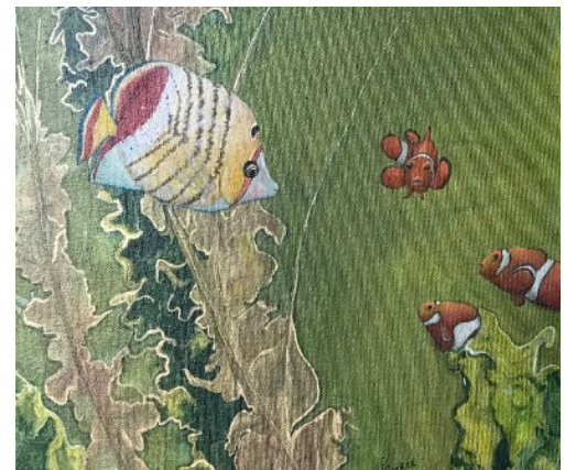
Detail of Deep Conversation , painted with gold paint that shines in sunlight