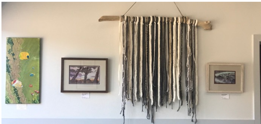
Also at Alder Acres: Deep Conversation , mixed media by Patty Becker ; Moody Sunset Bay and Bandon Beach , pastels by Liz Spona