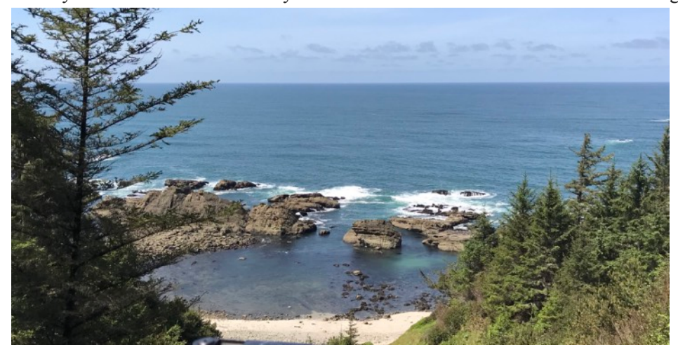
A view of the Cape