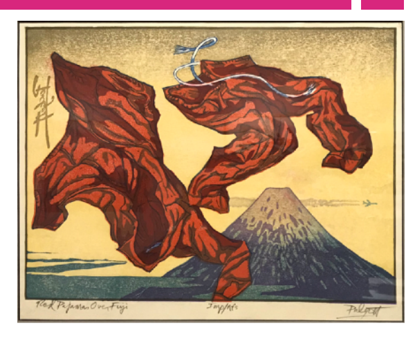
Kyoto II, print