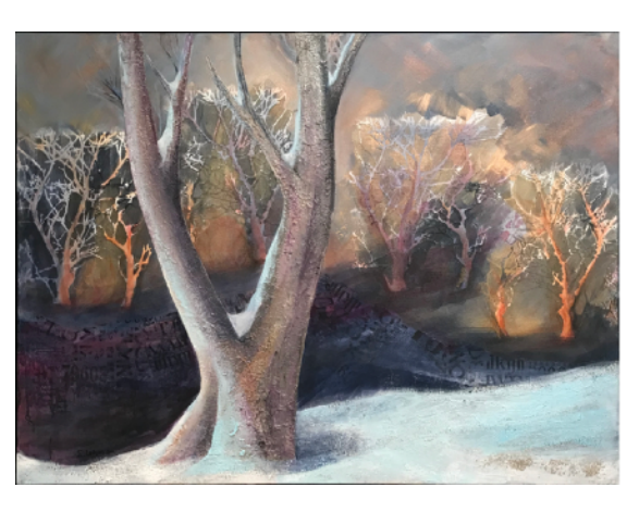
Oak Woods, Twilight, acrylic/collage by Susan Lehman