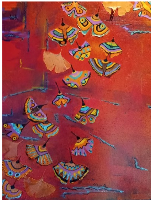
Ginkgo Flies, mixed media by Lizzy Sky