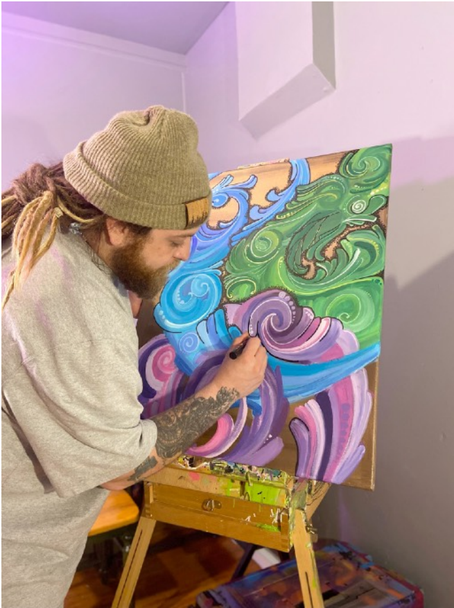
Working on Creative Flow , acrylic