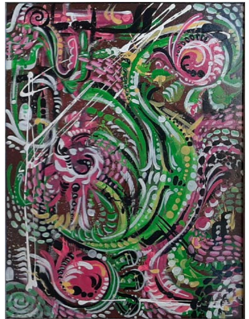
Out of the Ordinary , acrylic