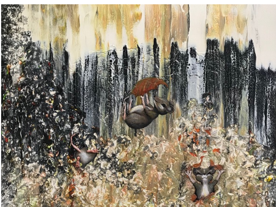
When Cat's Away, acrylic by Patty Becker