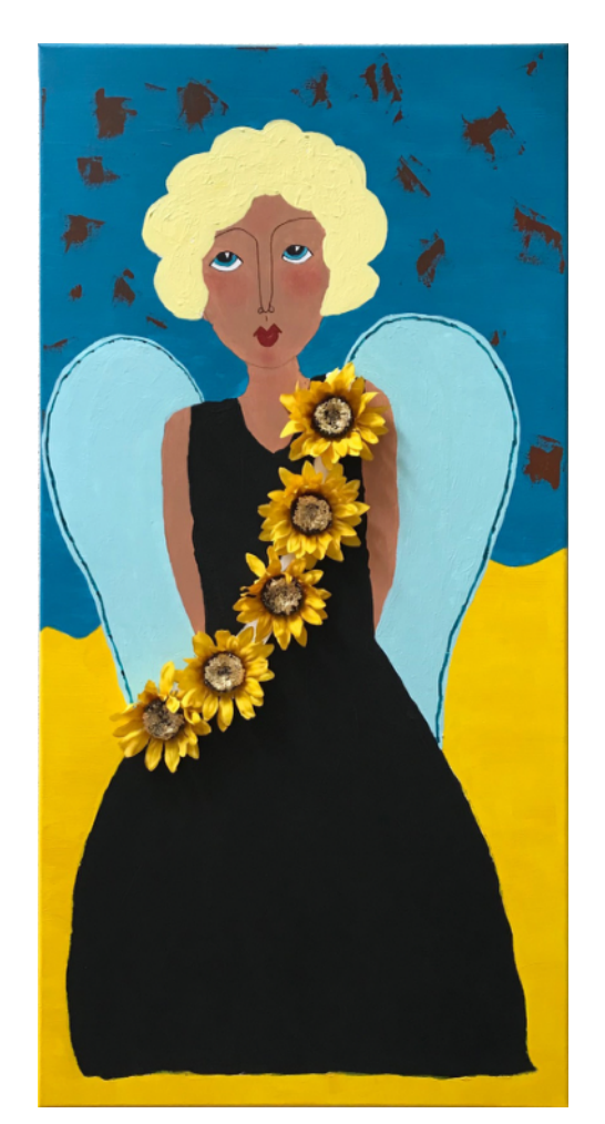
Ukraine, mixed media by Nadine Archer Allen