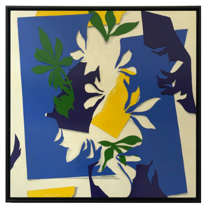
House Plant I, acrylic by Pat Snyder