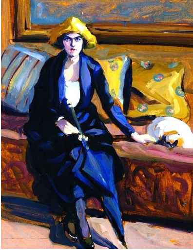
(Above is Not a self portrait)

She was born in Elgin, Illinois in 1876 and began her formal art training in 1894 at the Pratt Institute Art School. She began with still lifes and landscapes in a colorful, semi-Impressionistic manner under the influence of then famous Spanish artist Joaquin Sorolla y Bastida.