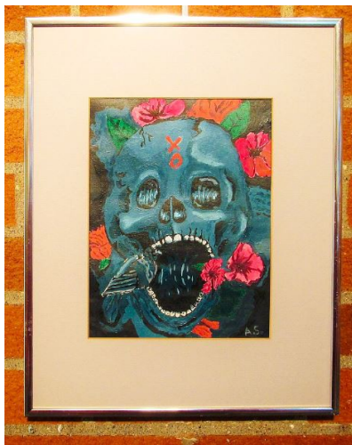
AARON SOLOMON (Grade 10) Flower Boy