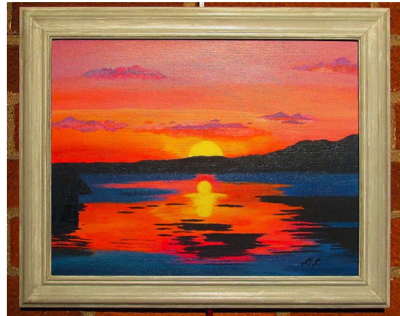
LIZBET LOPEZ Sunset Blvd