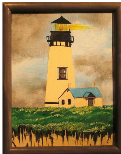
ZÖE SUNDBERG (Grade 11) Evening Lighthouse