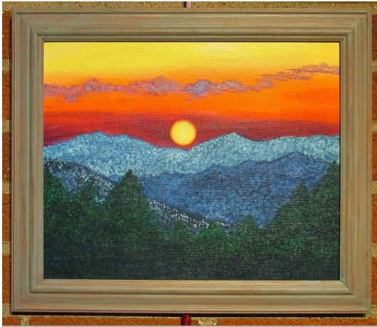
LIZBET LOPEZ (Grade 12) Mountain View