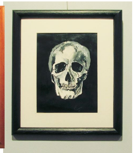
ELIAS FRAKES (Grade 10) Skull