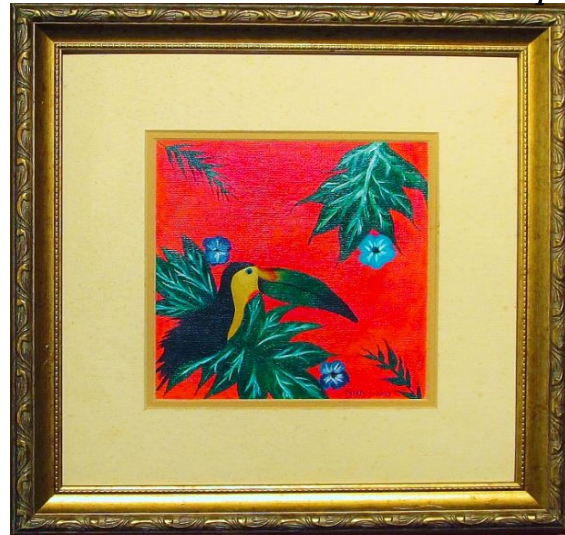
KIRAN KAUR If One Can, Toucan