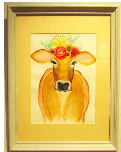
ZÖE SUNDBERG Floral Cow