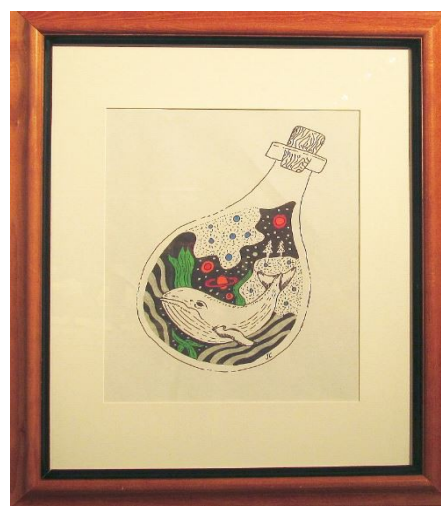
JAMISON CONGER Whale Bottle