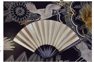
Traditional Odori fan

Photography (basically editing and focusing on just a moment in time) would have to take a back seat. Her editing career saw her working in television ("Seinfeld, "West Wing" and other award winners) until, eventually, she and her husband decided it was time for a change.