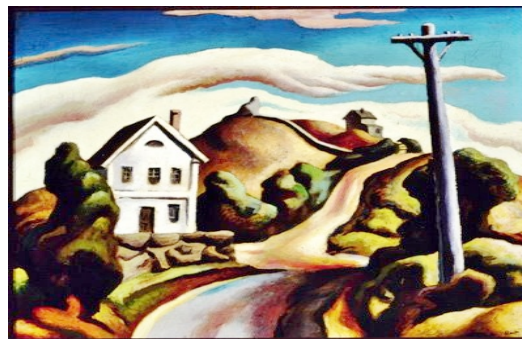
“Martha's Vineyard” T.H. Benton

Both artists are totally enamored of the American landscape and their styles derive from that love. It is their stylizations, shapes and strong lighting contrasts that lend the mystery and draw us into those scenes.