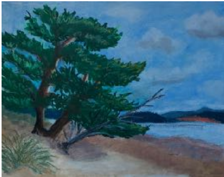
Tree across from the North Spit Boat Ramp painted by Archi Davenport