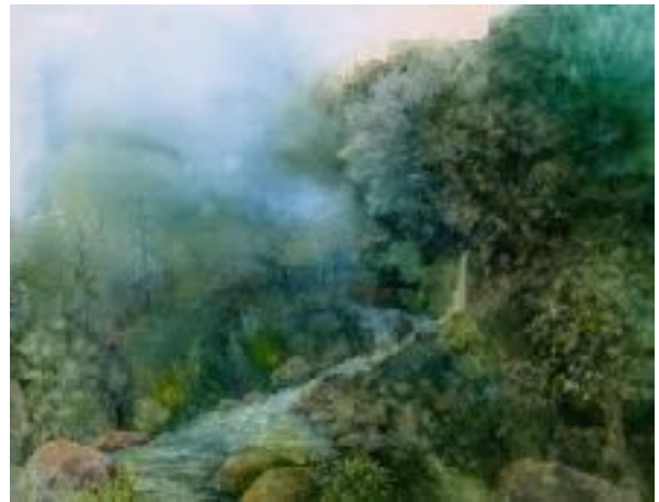
Peaceful Vista , watercolor pour technique by Jean Boynton