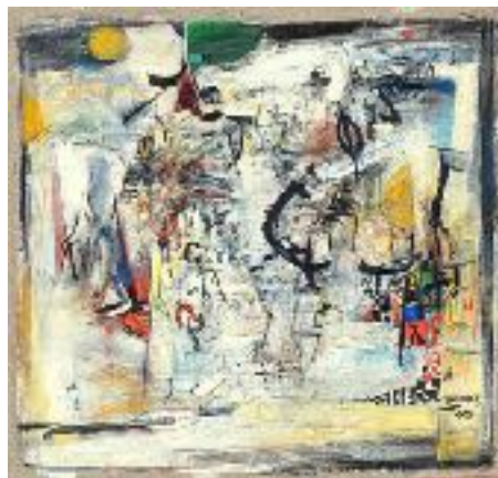
Portrait of the Artist III by Wosene Worke Kosrof