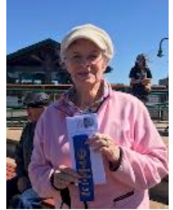
and the winner is...