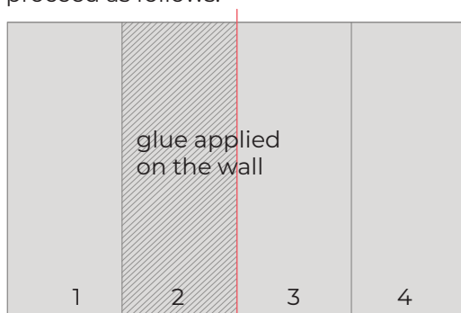
Even number of rolls

Studijo wallpapers come marked with serial numbers at the bottom. The rolls are placed next to each other (at zero). Each roll has extra material, 5 cm on the top and 5 cm on the bottom. The first and last roll will also have excess material on the sides. Their dimension depends on the ratio between the wall itself and the number of rolls. After you have checked the material and graphic appearance of the Studijo wallpaper, please proceed to mark the area for positioning the wallpaper in the rolls. Using a laser or tape measure, identify the center of your surface. Depending on the total number of lanes, proceed as follows: