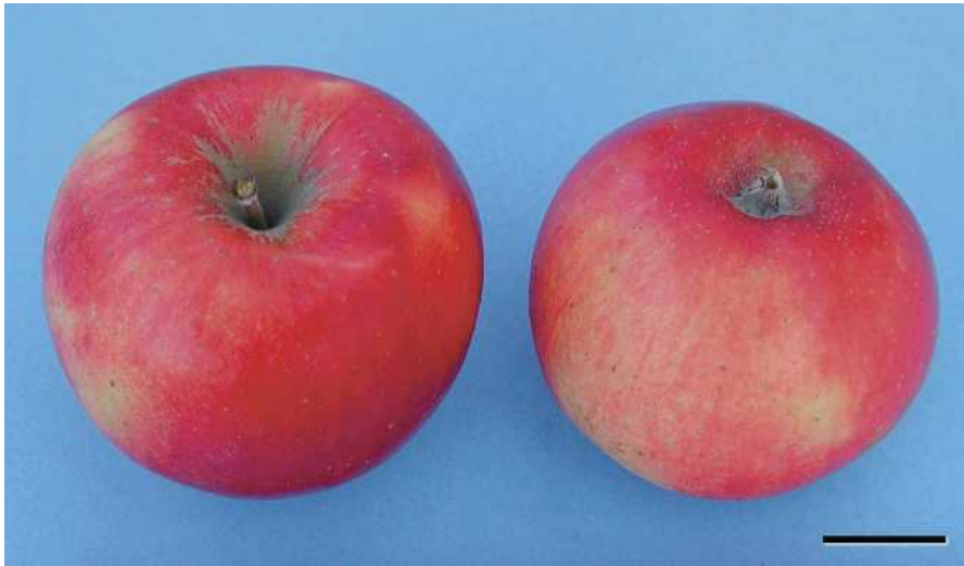
Fig. 1. Fruit of 'SPA343' (Sabina). The scale bar represents 2.0 cm.