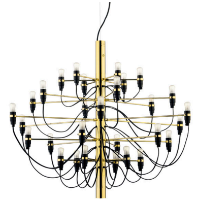
● AU140059-LED Brass