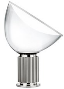
F6604004 Anodized Silver

Using a minimalist approach, Achille and Pier Giacomo Castiglioni used perspective to change the way we see everyday objects.