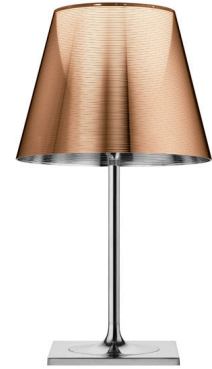
FU630346 Aluminized Bronze