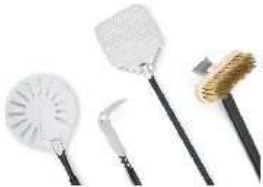
Aluminum Handled Pro Accessories Kit