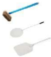
3 Piece Mini Pizza Oven Accessories Kit