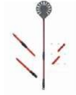
Pro 7" Round Peel With Breakdown Handle