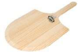
12", 14", 16" Wooden Launch Pad