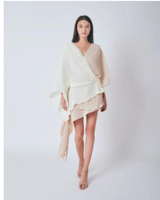
THE AVA MINI DRESS two toned in pleats with asymmetrical hemline