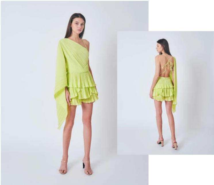
THE ISABELLE MINI DRESS In pleats, backless with embellished string details