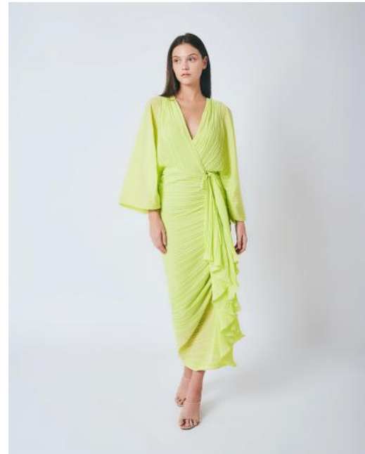
THE ALICIA DRESS in pleats with drapes