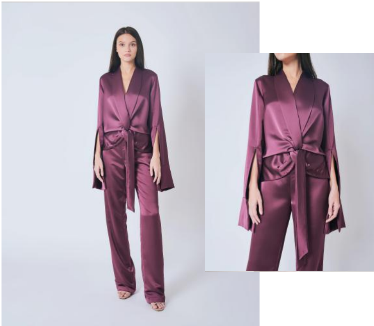
THE LARA PANTSUIT in satin with open sleeves