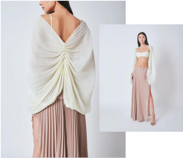
THE OASIS BOLERO draped butterfly back in pleats