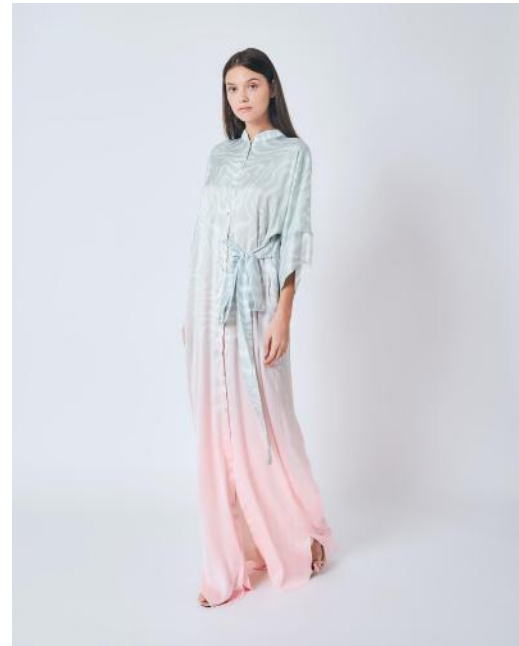
THE DATAI PINK WAVES SHIRT DRESS pure silk lining with attached side sash in custom print in jacquard