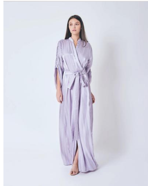
THE WRAP SHIRT DRESS in liquid satin