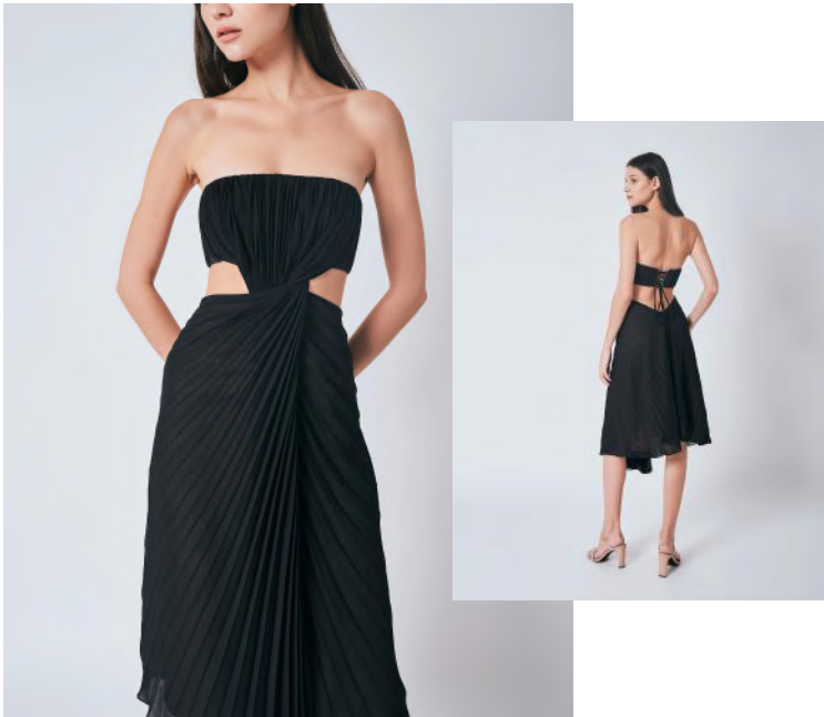
NOIR TWIST LBD In sun pleats with strapless laced back