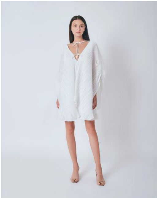
THE BUTTERFLY DRESS in pleated jacquard with embellished string detail