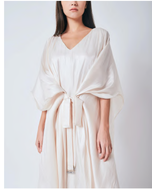
THE SIGNATURE DRAPED KAFTAN in liquid satin with embellished sash