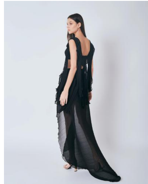
NOIR SET draped bralette & skirt in pleats