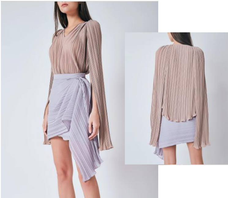
THE SIGNATURE BLOUSE & MINI SKIRT in pleats with open sleeve top & draped skirt