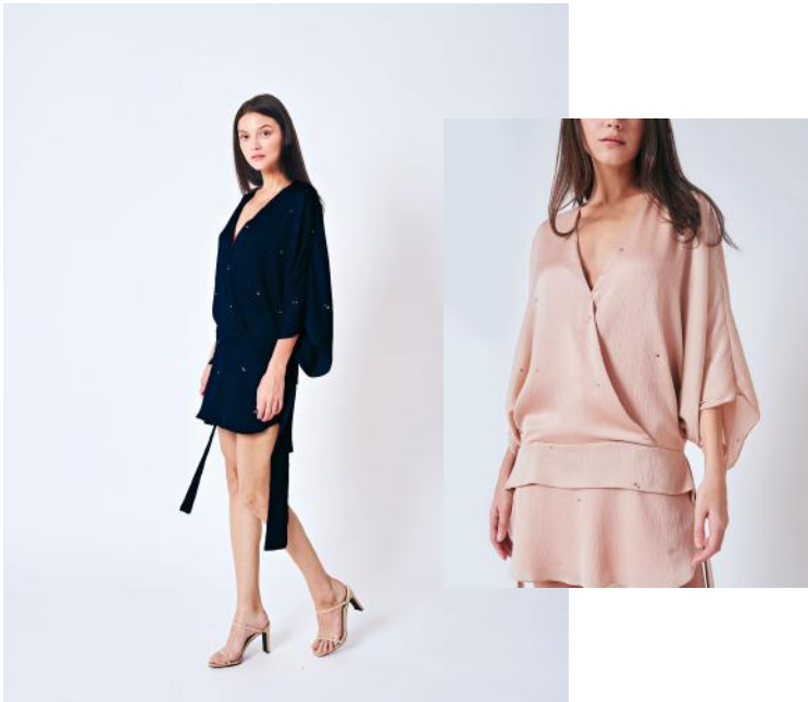
THE RITA MINI DRESS in jacquard with rhinestone embellishments