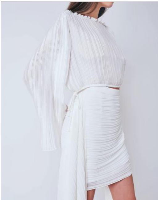
THE DIANA TOP & SKIRT in pleated jacquard with drawstring top & draped skirt