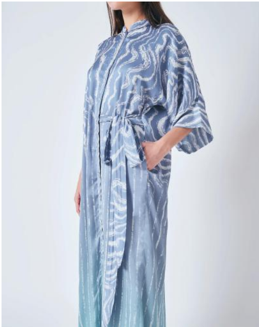
THE DATAI BLUE WAVES SHIRT DRESS pure silk lining with attached side sash in custom print in jacquard