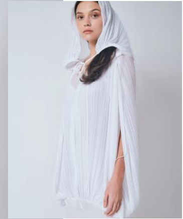
THE TALIE SET draped top & skirt in pleats