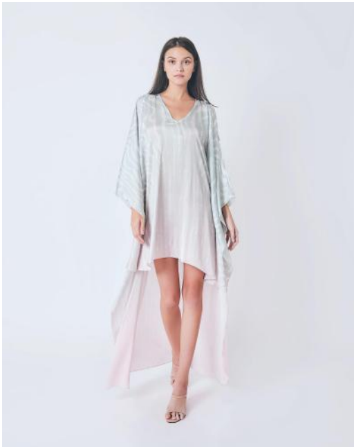
THE DATAI PINK WAVES TAIL KAFTAN hi-low hemline in custom print jacquard