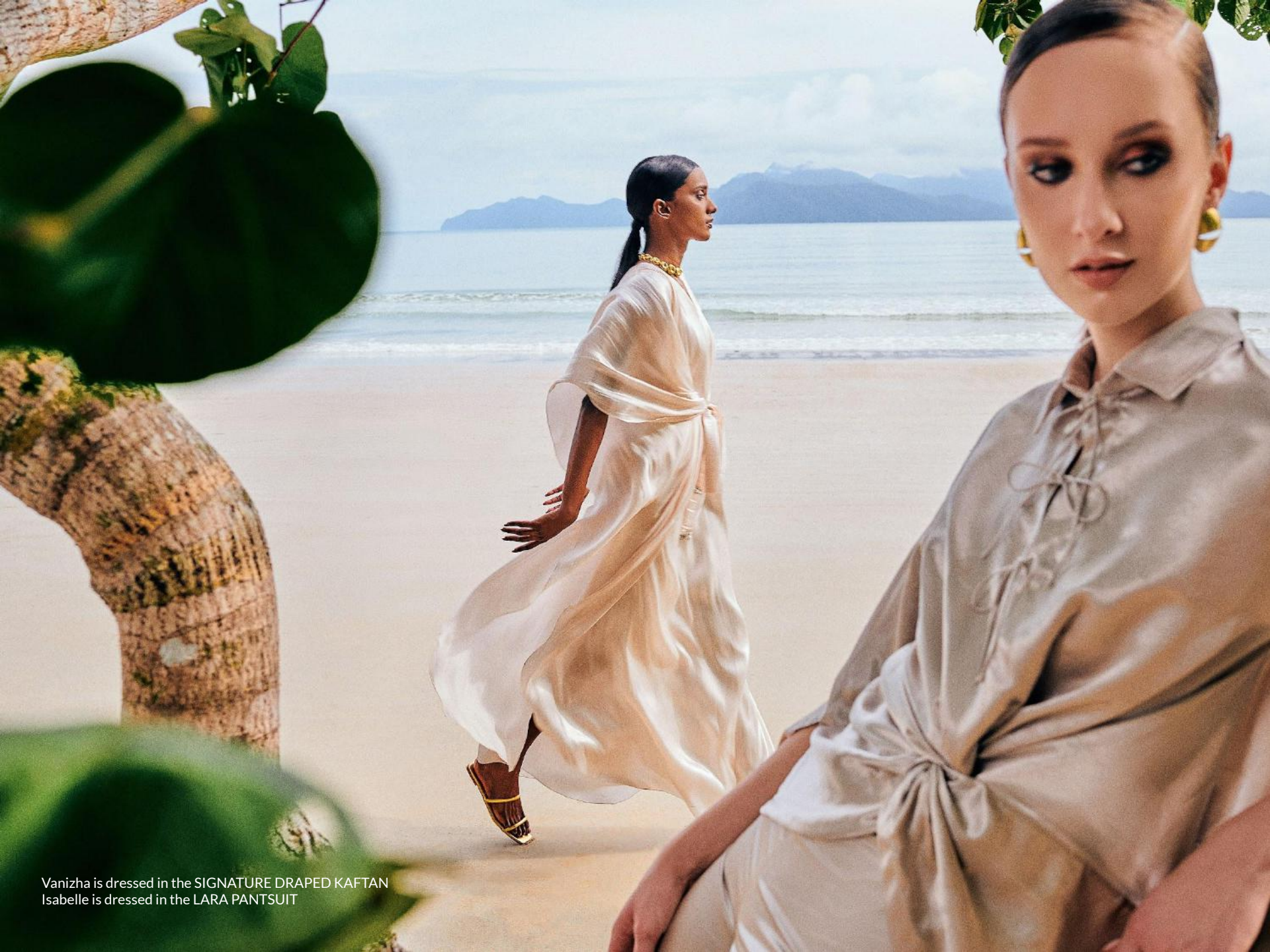
Vanizha is dressed in the SIGNATURE DRAPED KAFTAN Isabelle is dressed in the LARA PANTSUIT