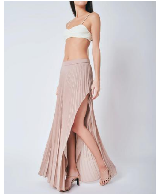
THE DUNE SKIRT in pleats with high slit