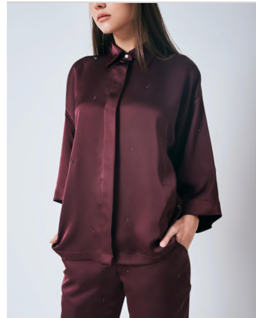
THE OASIS PYJAMAS in heavy satin with rhinestone embellishments