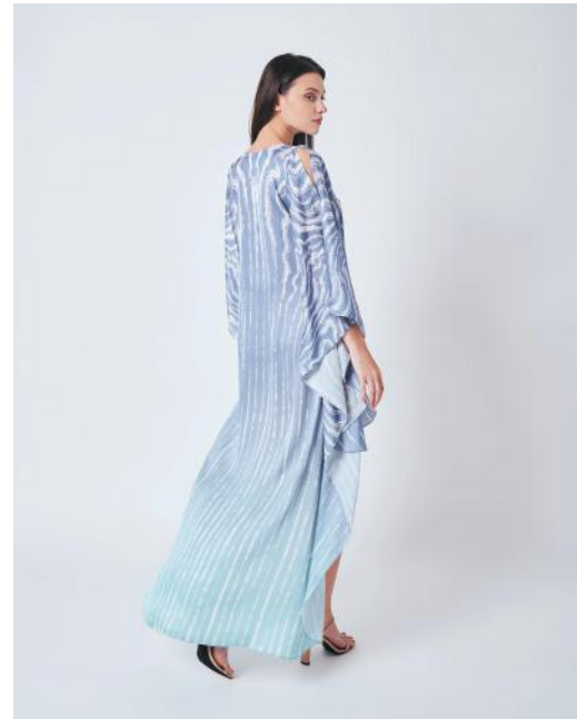
THE DATAI BLUE WAVES TAIL KAFTAN hi-low hemline in custom print jacquard