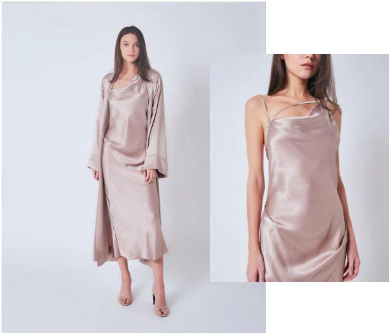
THE LOLA ROBE & SLIP SET in viscose