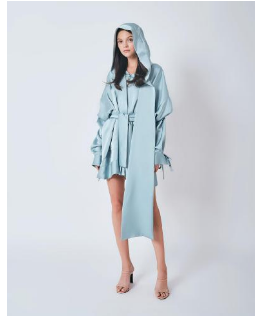
THE ATHINA HOODED PARKA zip-up in heavy satin with rhinestone embellishments