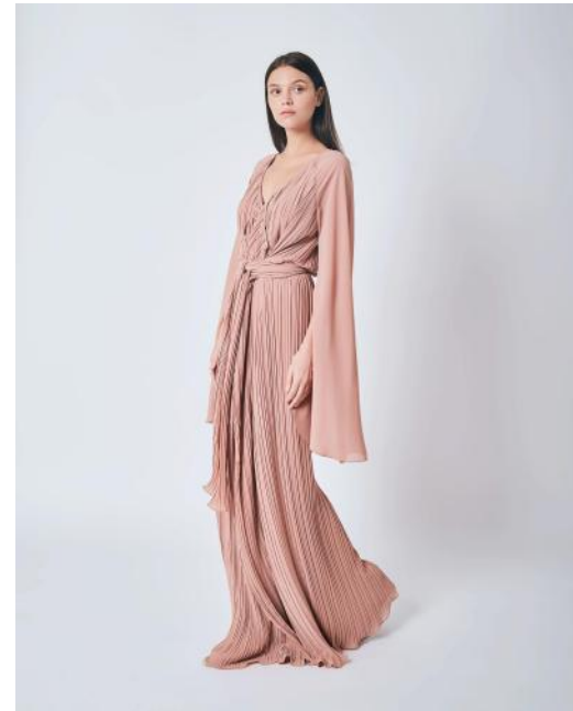
THE SIGNATURE WRAP DRESS in pleats with open sleeves