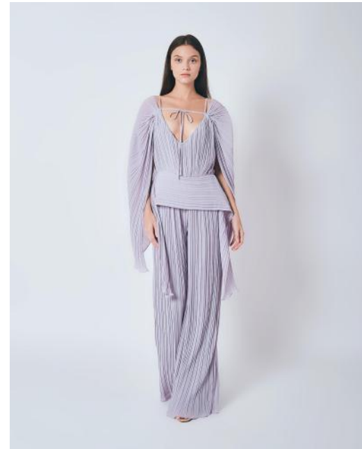
THE ALIA JUMPSUIT in pleats with open sleeves & string details