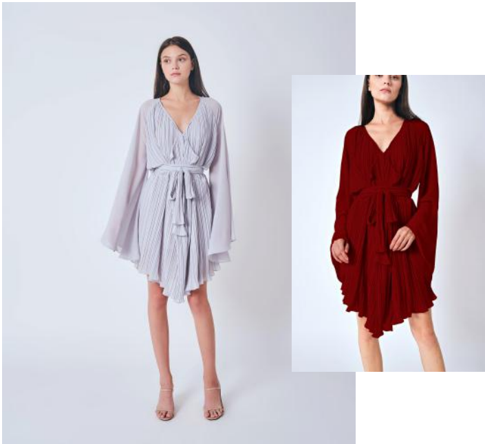
THE DAIYAN WRAP DRESS in pleats with bell sleeves