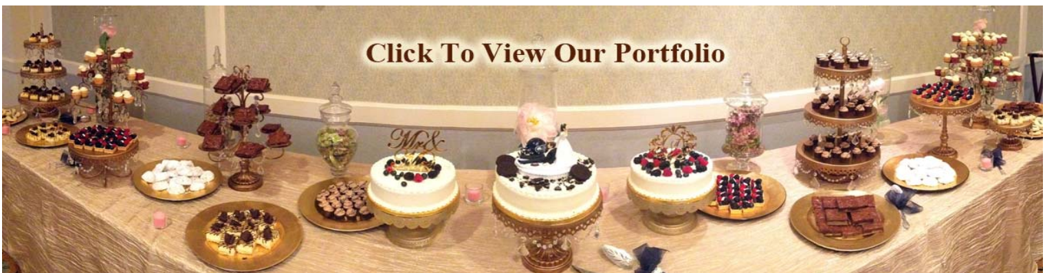
Click To View Our Portfolio

CUPCAKE PRICING are with standard swirls. Additional embellishments such as sugar flowers or white chocolate seashells are extra and quoted on request.