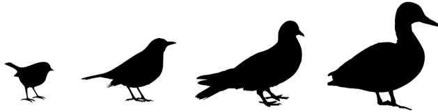
A Robin A Blackbird A Pigeon A Mallard

Was it smaller, larger or roughly the same size as: