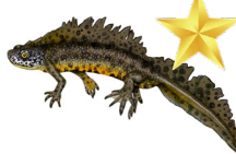
Great Crested Newt