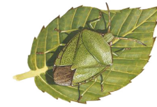
Green Shield bug