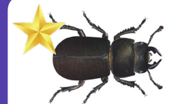
Lesser Stag Beetle