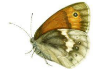
Small Heath Butterfly