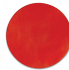
x6 ADHESIVE TABS