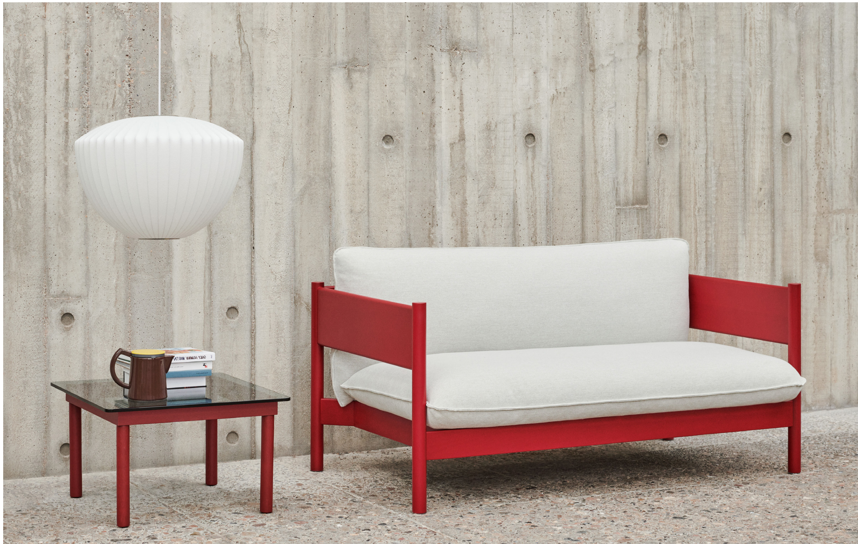
Arbour Club Sofa, Mode 009