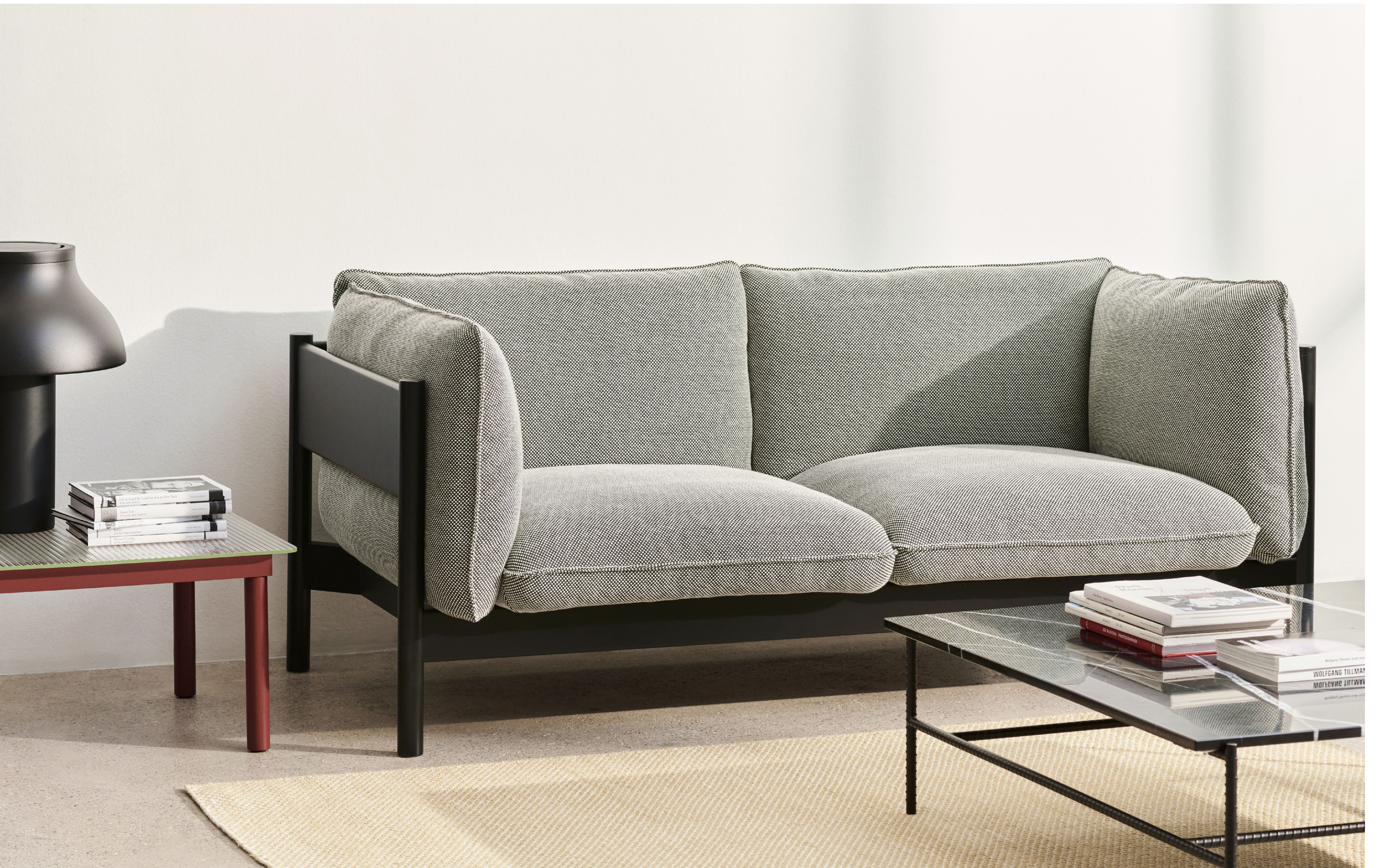
Arbour 2 Seater, DOT 1682 02 Bianco Nero