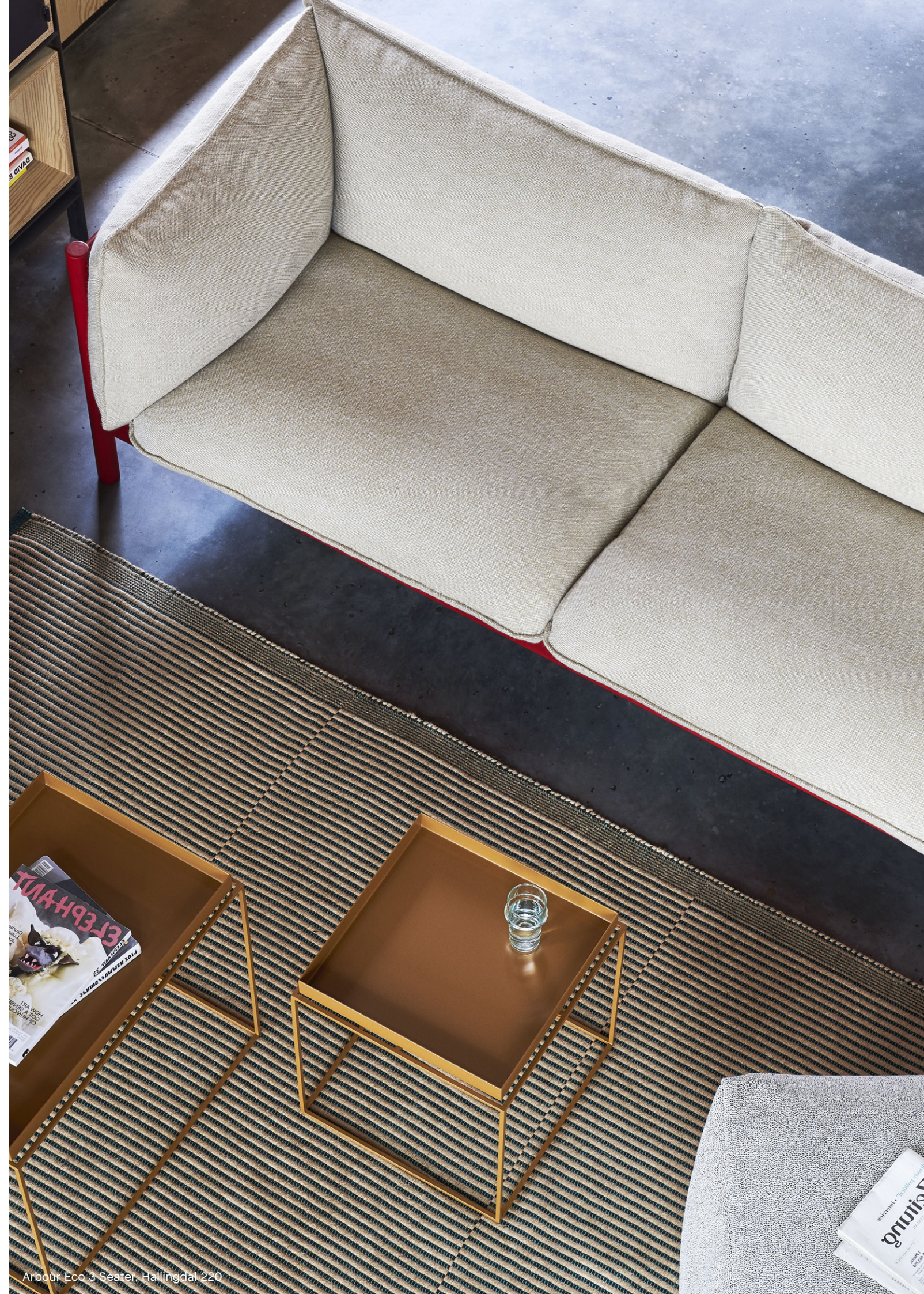
Arbour Eco 3 Seater, Hallingdal, 220