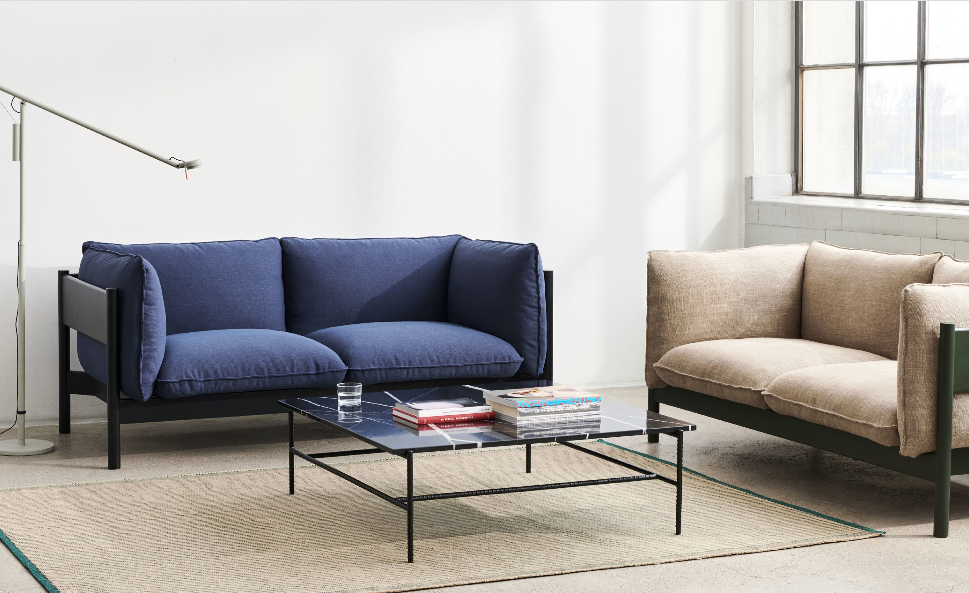
Arbour Eco 2 Seater, Steelcut Trio 796 Arbour 2 Seater, Linen Grid dark beige