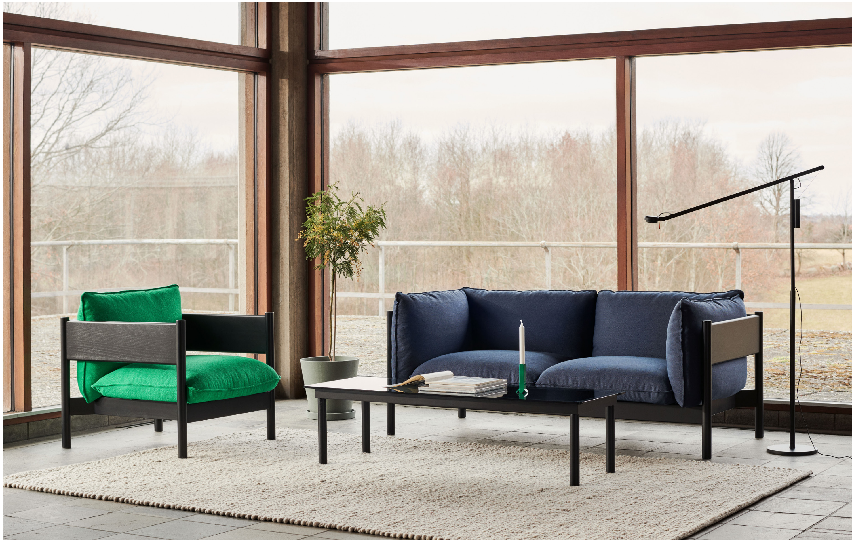
Arbour Eco Club Armchair, Vidar 932 Arbour Eco 2 Seater, Steelcut Trio 796