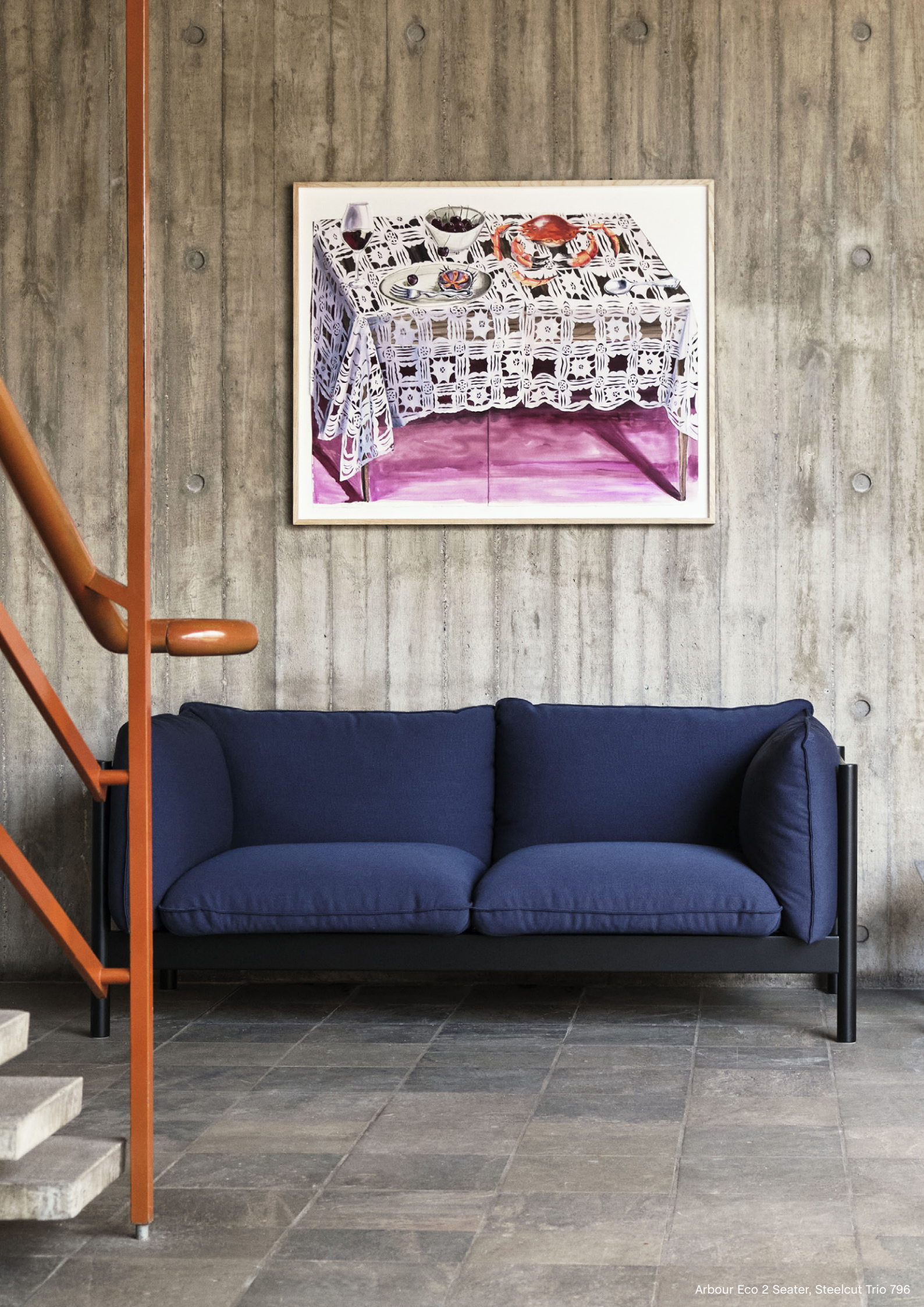
Arbour Eco 2 Seater, Steelcut Trio 796