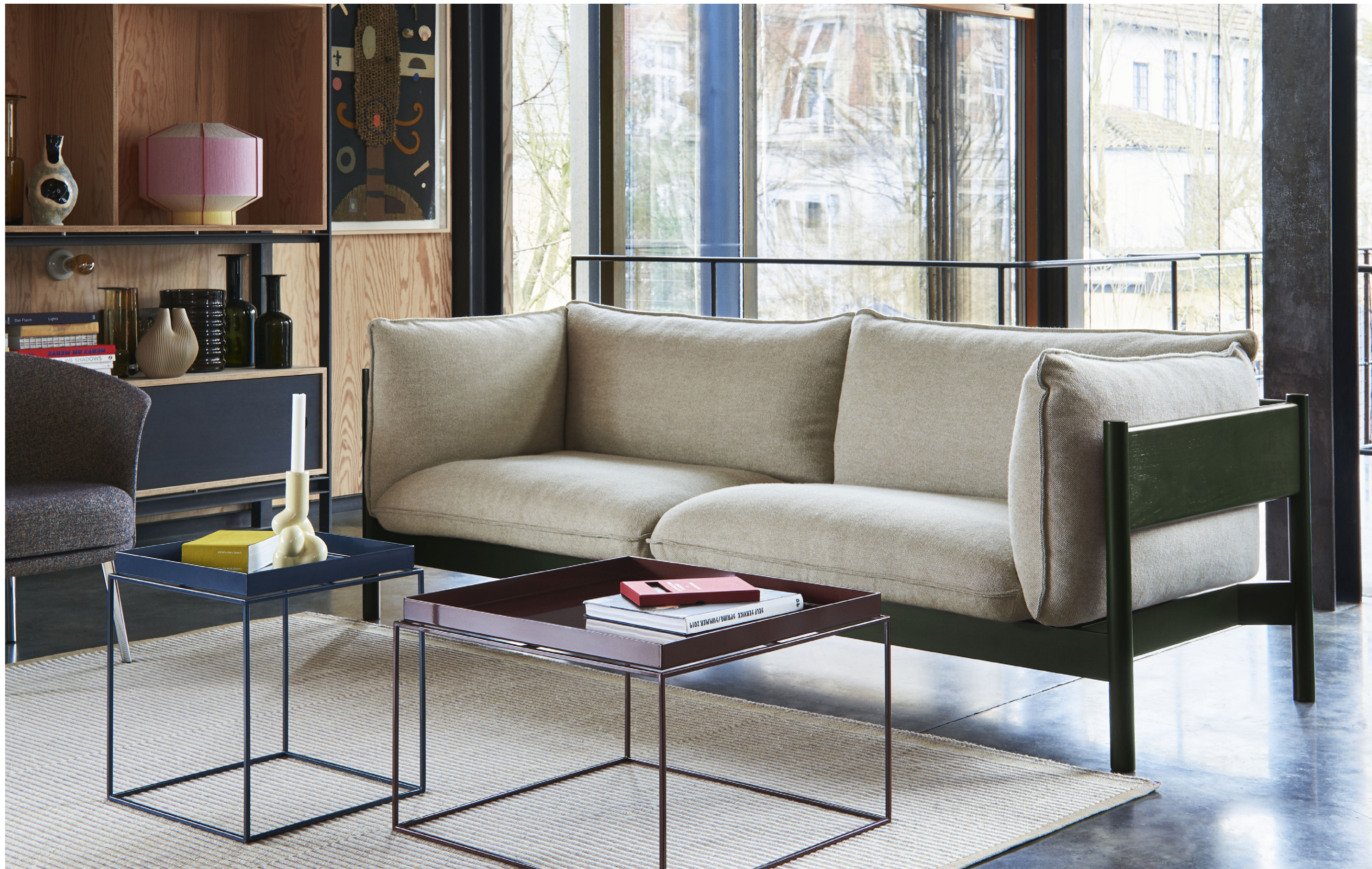
Arbour Eco 3 Seater, Hallingdal 220