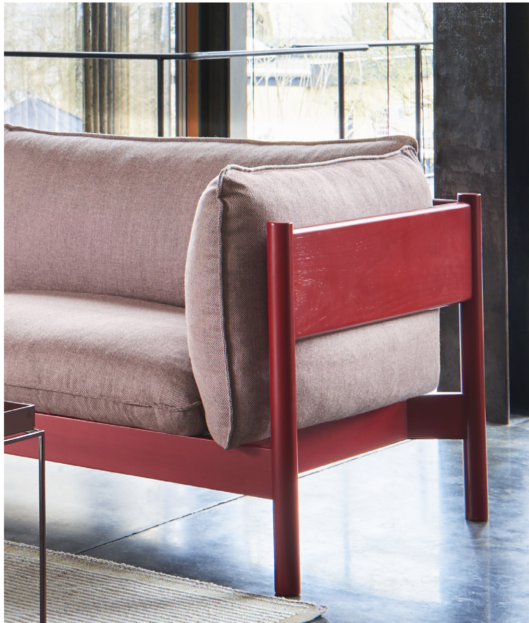
Arbour Eco 3 Seater, Re-wool 648