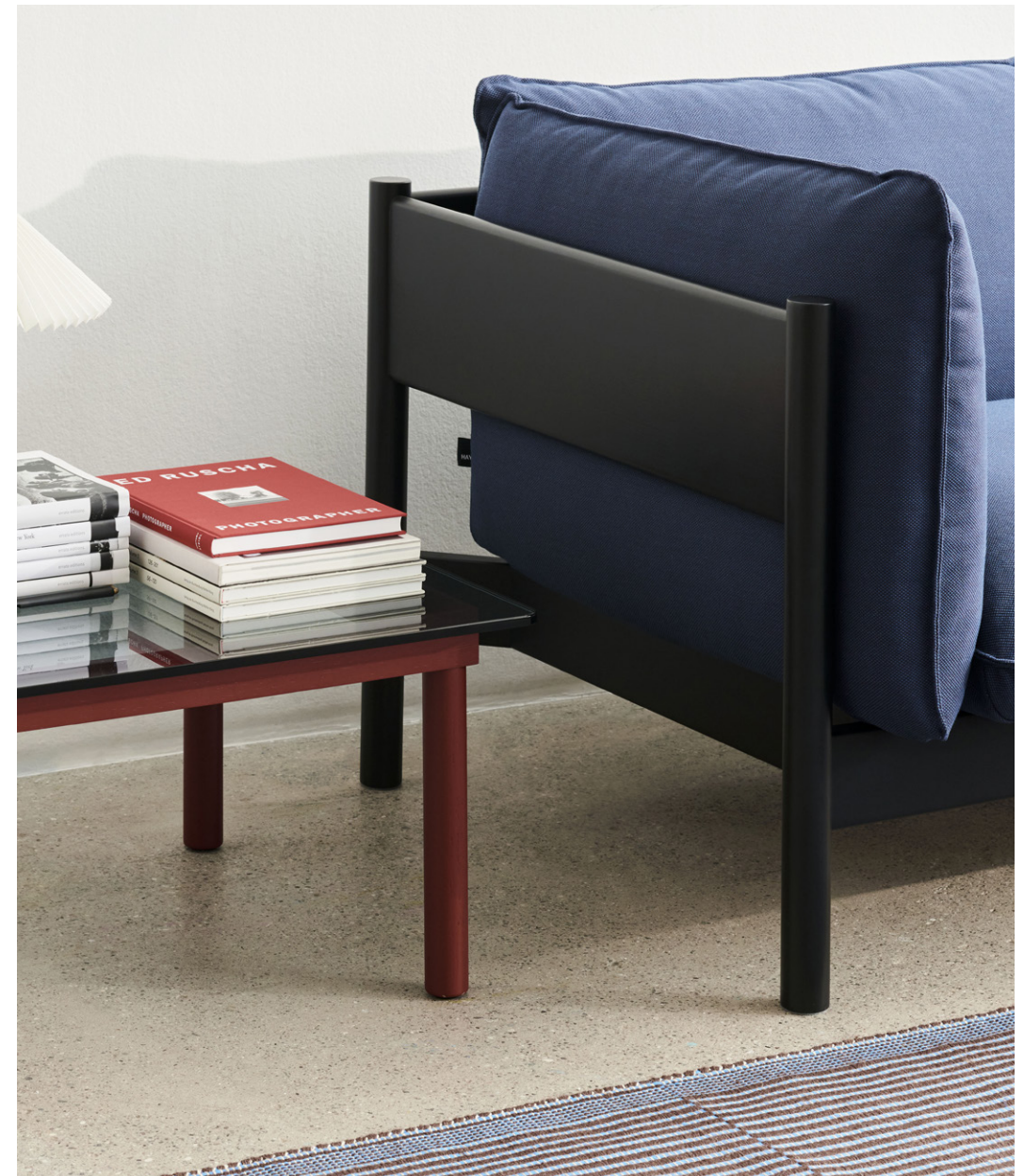
Arbour Eco 2 Seater, Steelcut Trio 796