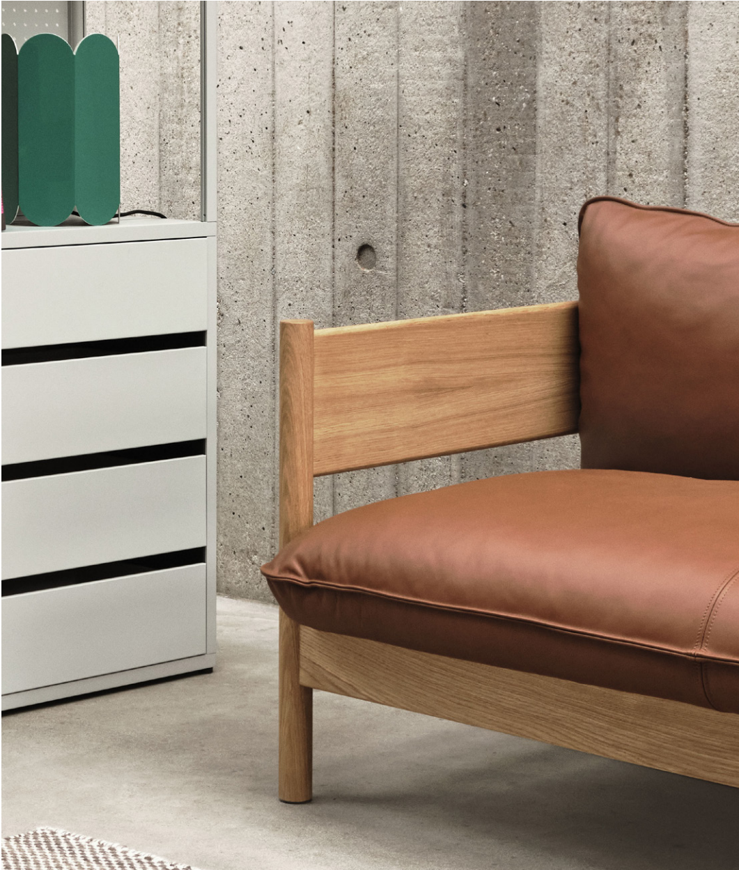
Arbour Club Sofa, Nevada NV2488S Cognac