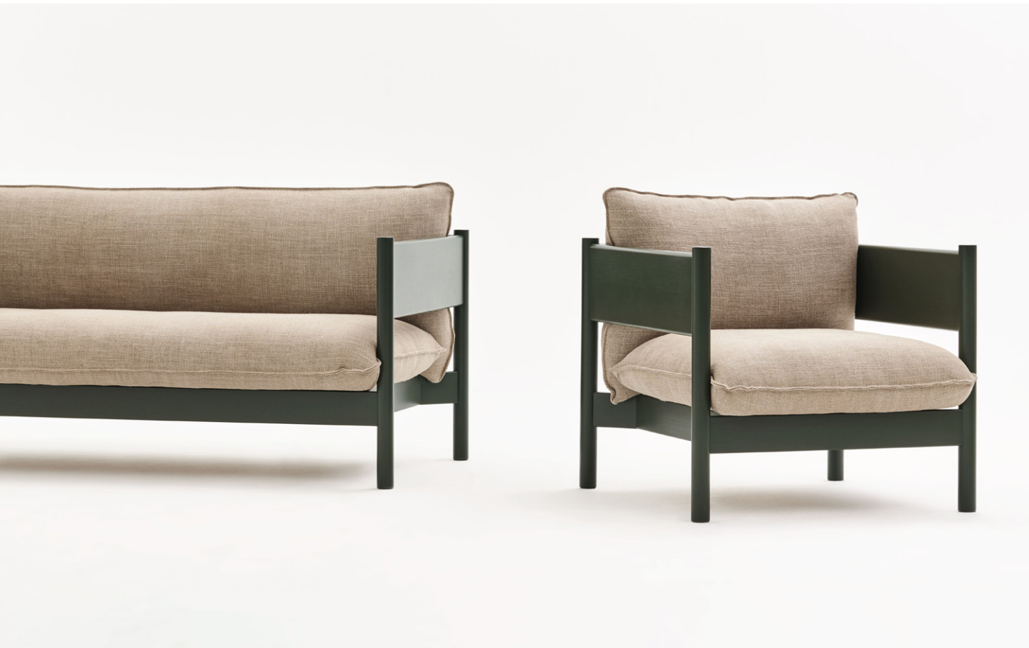
The latest members of the Arbour family, the Arbour Club Sofa and Armchair, share the same concept that design should follow construction.