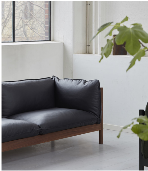
Arbour's clean appearance and use of natural materials give the sofa a clear Scandinavian connection.