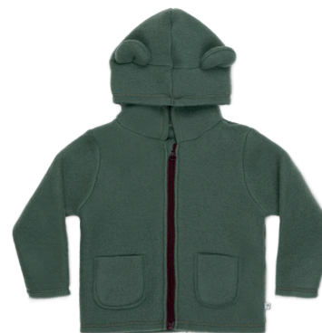
Bear Jacket in Brushed Wool Sizes: 62/68 , 74/80 , 86/92 , 98/104