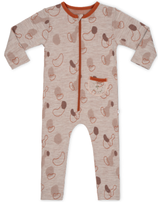
Jumpsuit with zipper