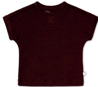
T-Shirt Sizes: 62/68 , 74/80 , 86/92 , 98/104