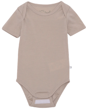
Short Sleeved Body - with velcro Sizes: 50/56 , 62/68 , 74/80 , 86/92