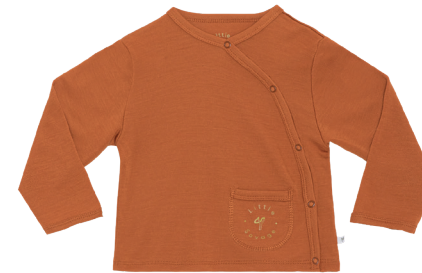
Kimono Cardigan Sizes: 62/68 , 74/80 , 86/92 , 98/104