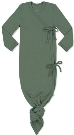
Sleep Gown Sizes: 50/56 , 62/68 , 74/80