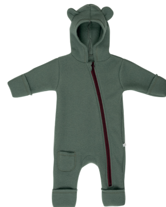
Hooded Suit in Brushed Wool Sizes: 50/56 , 62/68 , 74/80 , 86/92