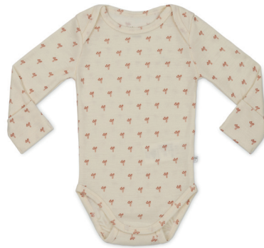
Long Sleeved Body - with velcro Sizes: 50/56 , 62/68 , 74/80 , 86/92