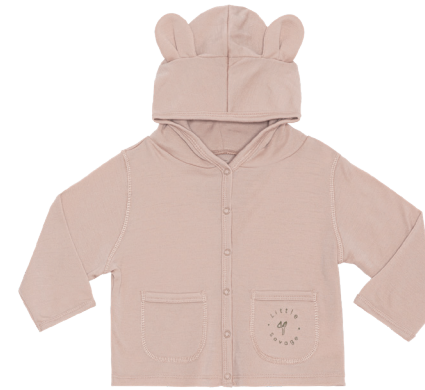
Bear Jacket Sizes: 50/56 , 62/68 , 74/80 , 86/92 , 98/104