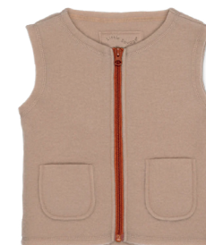
Vest in Brushed Wool Sizes: 50/56 , 62/68 , 74/80 , 86/92 , 98/104