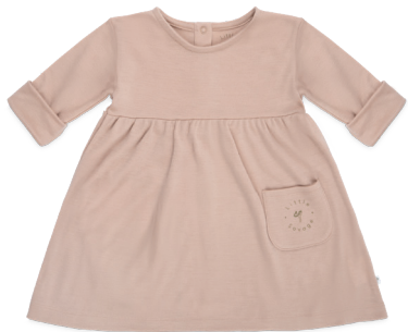
Tulle Dress Sizes: 62/68 , 74/80 , 86/92 , 98/104