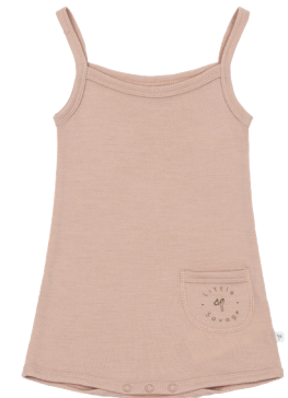
Strap Body Sizes: 62/68 , 74/80 , 86/92