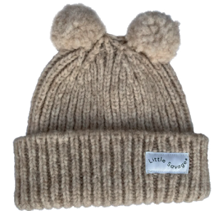
Beanie with Pom Pom