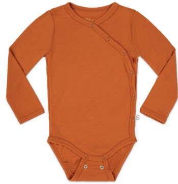
Kimono Body Sizes: 50/56 , 62/68 , 74/80 , 86/92