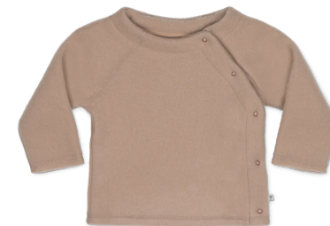
Kimono Jacket in Brushed Wool Sizes: 62/68 , 74/80 , 86/92 , 98/104