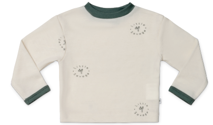
Long Sleeve T-Shirt Sizes: 74/80 , 86/92 , 98/104