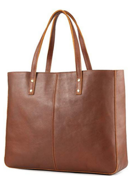
LAXA HANDBAG Code: LSC-LG-FA-21 Material : Bovine Leather Color: Rust ( Assorted Colors)

Code: LSC-LG-FA-20 Material : Python Leather - Hand painted Color: Natural ( Assorted Colors)