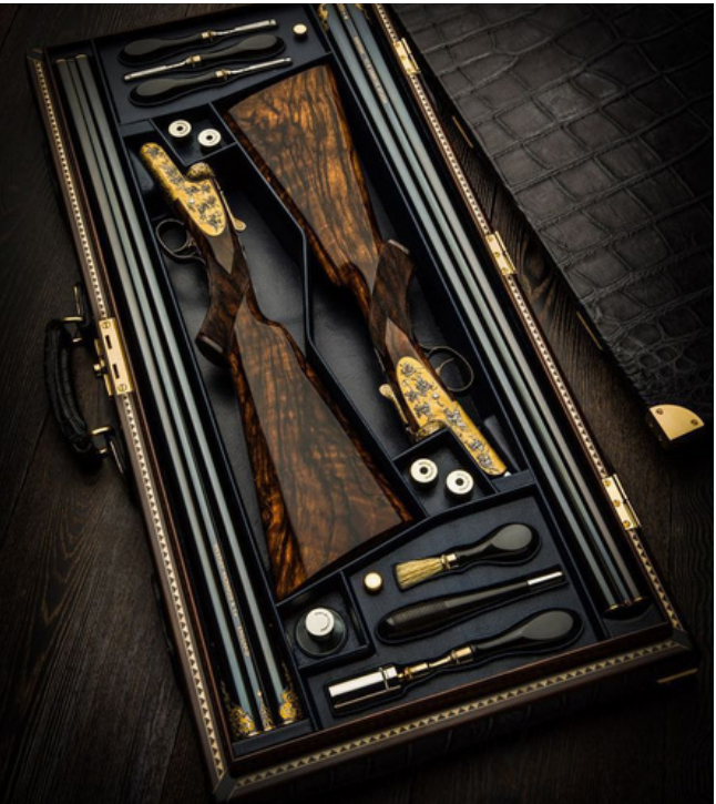
DOUBLE SHOTGUN CASE Code: LSC-LG-TM-02 Material : Crocodile Leather Color: Brown

CUSTOM GUN CASE Code: LSC-LG-TM-01 Material : Elephant Leather Color: Brown