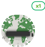
Breakout Board with Battery (1)