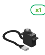
Continuous Servo Motor