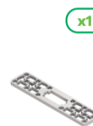
Medium Servo Frame