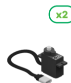
Continuous Servo Motor