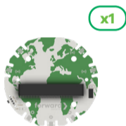
Breakout Board with Battery (1)