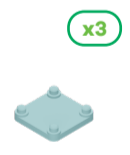
Component Backing Connector (2)