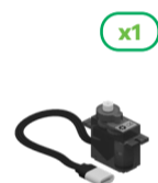
Positional Servo Motor