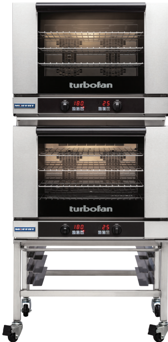
Model E28D4/2C shown

Double Stacked on a Stainless Steel Base Stand