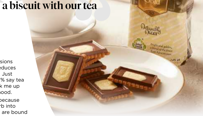
Chocolate Crest Biscuits £2.20 150g