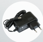
24V 0.38A Adapter