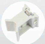
Mounting pole bracket