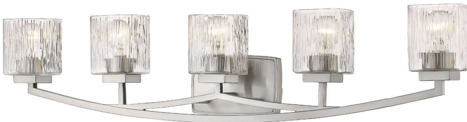
| E |