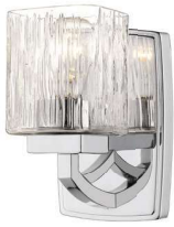
| F |