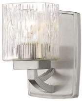
| A |

The Zaid collection of contemporary bath fixtures are defined by the gentle curve of the fixture arm paired with the finely variegated detail of the Clear glass shades. These contemporary fixtures are offered in many sizes and a choice finishes which include Bronze, Brushed Nickel, or Chrome.