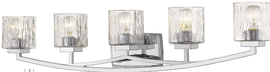
| J |