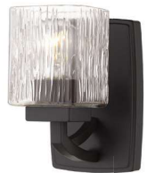
| K |