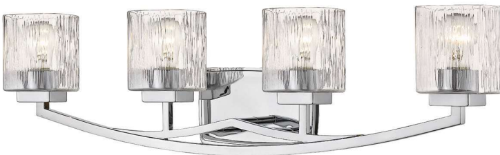
| I |