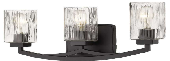
| M |