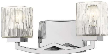
| G |