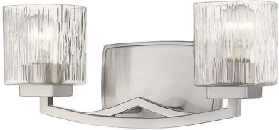
| B |