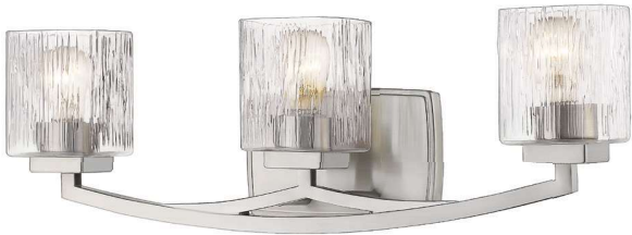
| C |

These fixtures can be mounted up or down