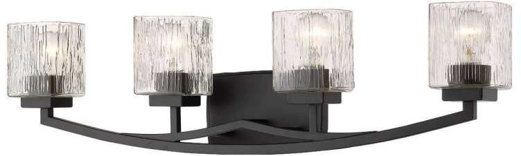
| N |