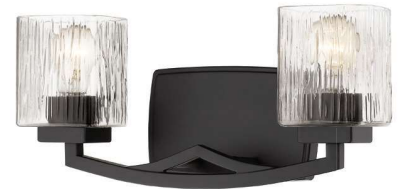
| L |