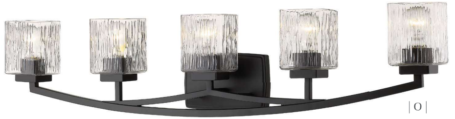
| O |