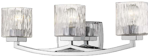
| H |