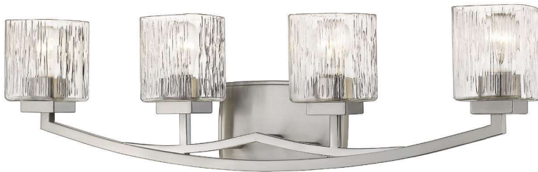
| D |