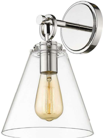
| C |