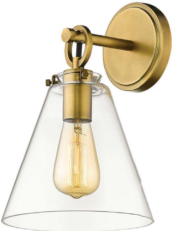
| D |