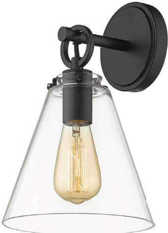
| B |