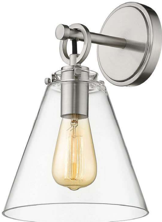
| A |