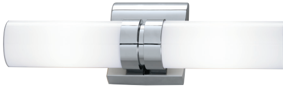
Wave Double Sconce 8902 -CH-SO