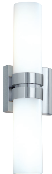
Wave Double Sconce 8902 -BN-SO