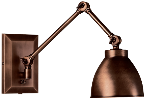
Maggie Swing Arm 8471-AR-MS