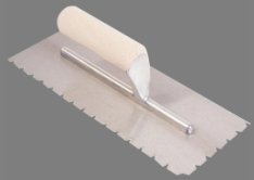
3/16" x 1/4" V-Notch Trowel