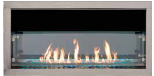
VRE4636 shown with Sapphire Blue large crushed glass media & optional see-through kit