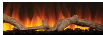
Yellow flame setting shown with driftwood log set