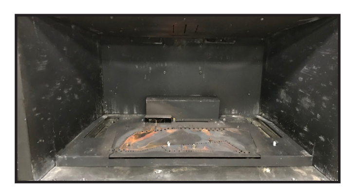
Figure 3. Empty Firebox

1. Install base refractory. See Figure 4.