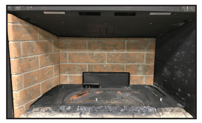
Figure 7. Left Refractory Installed