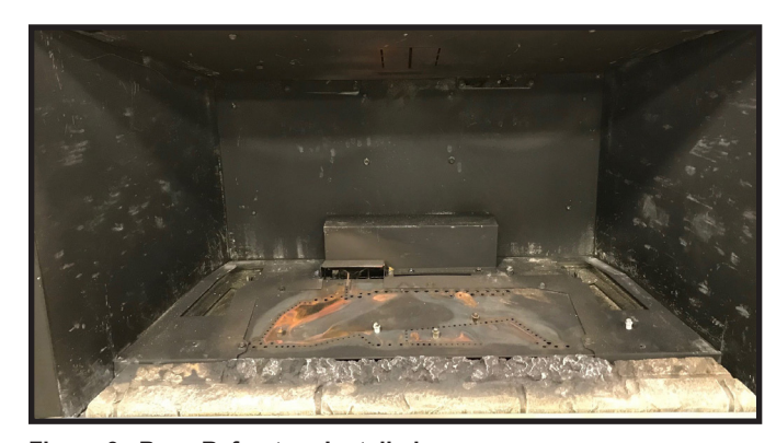
Figure 3. Base Refractory Installed