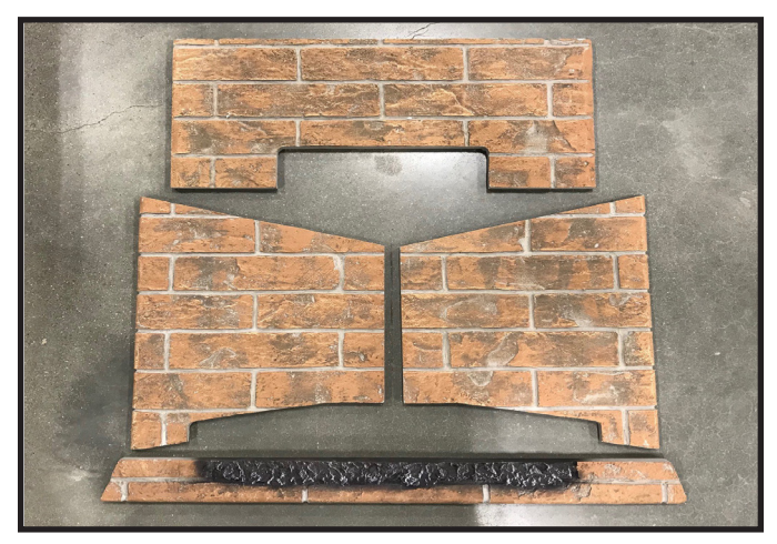
Figure 1. Refractory Kit Components

If replacement panels are needed, the entire kit must be ordered.