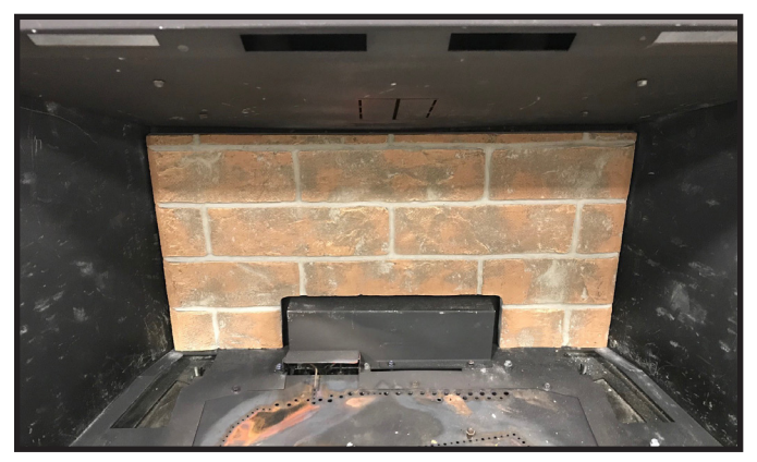
Figure 5. Back Refractory Installed