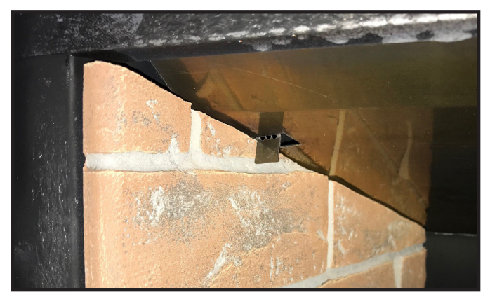
Figure 7. Left Refractory Handbend Tab