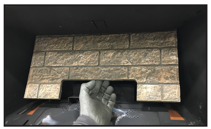
Figure 4. Back Refractory

Be sure to hold back refractory in upright position until side panels get installed.