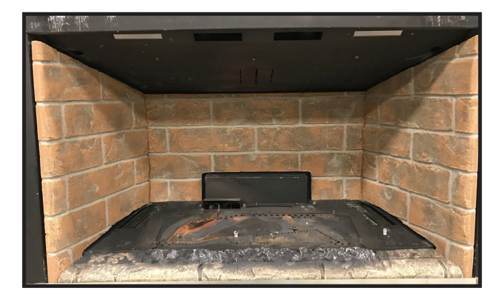
Figure 8. Refractory Kit Installed

Please contact your Hearth & Home Technologies dealer with any questions or concerns. For the location of your nearest Hearth & Home Technologies dealer, please visit www.hearthnhome.com.