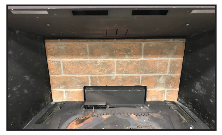
Figure 5. Back Refractory Installed

Install back refractory. See Figure 5.Be sure to hold back refractory in upright position until side panels get installed.