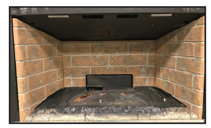
Figure 9. Refractory Kit Installed