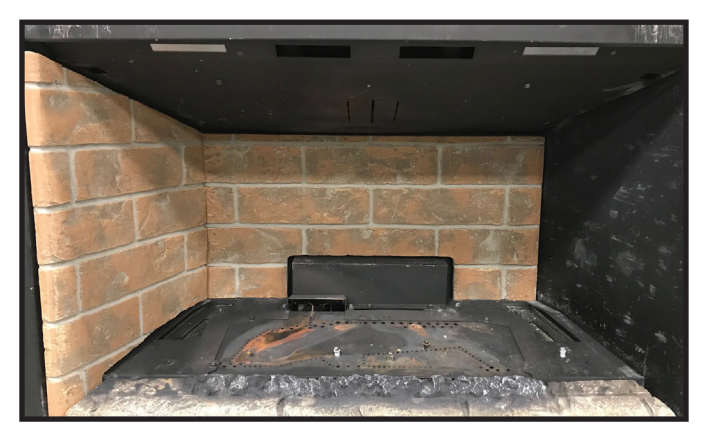
Figure 6. Left Refractory Installed

3. Install left and right refractory, bend down tabs to hold in place. See Figures 6, 7 & 8.