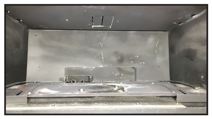
Figure 2. Empty Firebox

1. Install base refractory. See Figure 4.