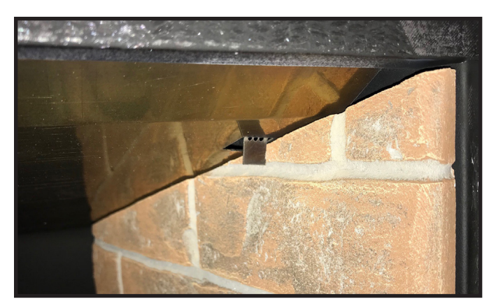
Figure 8. Right Refractory Handbend Tab