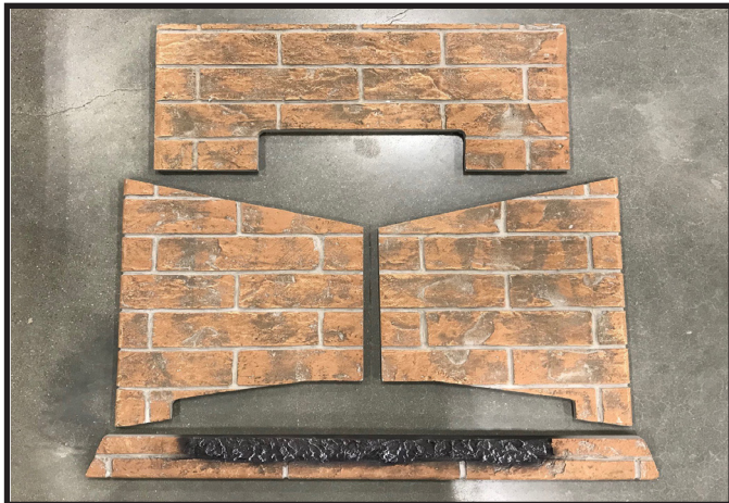
Figure 1. Refractory Kit Components

If replacement panels are needed, the entire kit must be ordered.