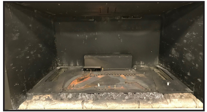
Figure 3. Base Refractory Installed