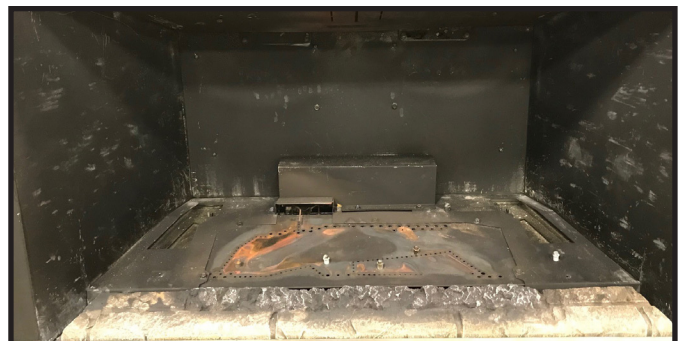
Figure 4. Base Refractory Installed