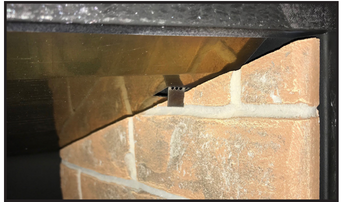
Figure 8. Right Refractory Handbend Tab