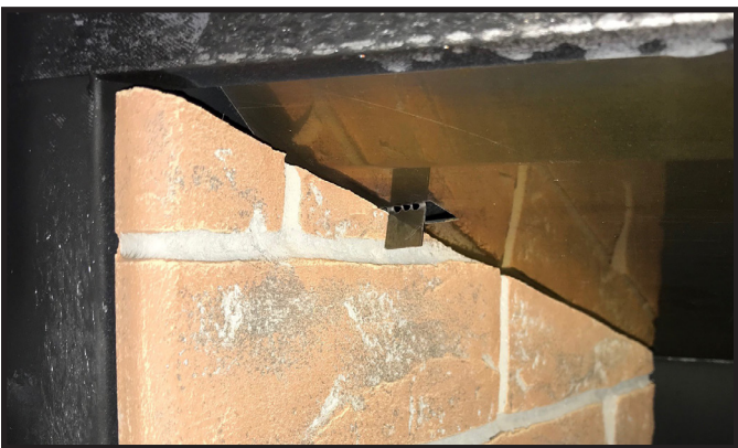
Figure 7. Left Refractory Handbend Tab