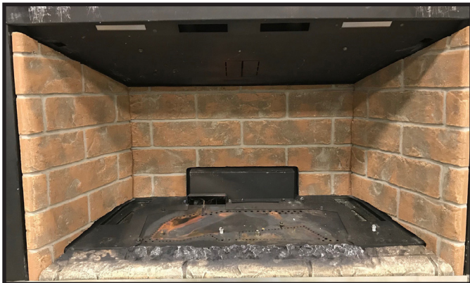
Figure 8. Refractory Kit Installed

Please contact your Hearth & Home Technologies dealer with any questions or concerns. For the location of your nearest Hearth & Home Technologies dealer, please visit www.hearthnhome.com .