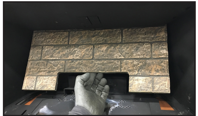
Figure 4. Back Refractory

Be sure to hold back refractory in upright position until side panels get installed.