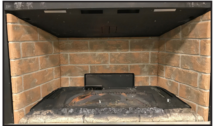
Figure 9. Refractory Kit Installed