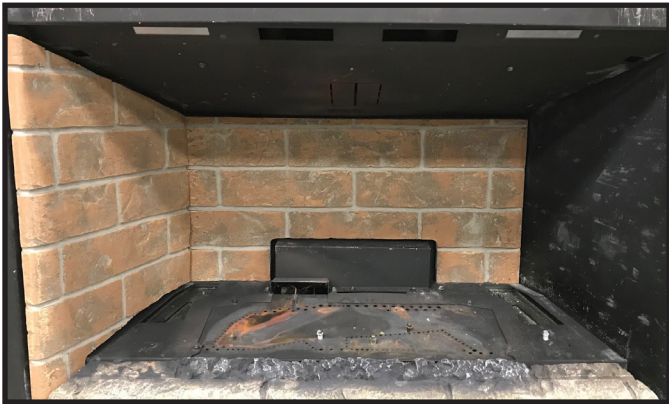
Figure 6. Left Refractory Installed