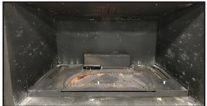
Figure 3. Empty Firebox