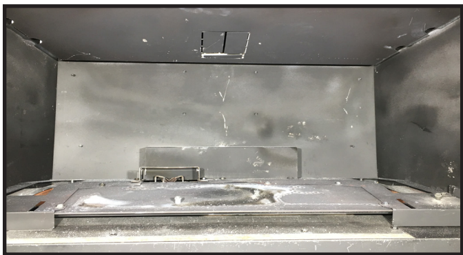
Figure 2. Empty Firebox