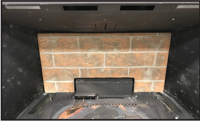
Figure 5. Back Refractory Installed