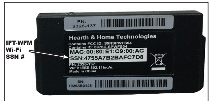
Figure 1 IFT-WFM Wi-Fi SSN # Location

CAUTION! Do not install damaged components. If you received components that are damaged, contact your dealer for assistance.