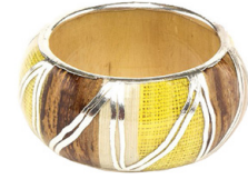
IBIZA Embellished bangle in banana, palm, & abaca fiber Wholesale : $58 Suggested Retail : $115 SKU 13GR5-B-3 IBIZA