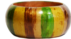
MALIA Laminated wood bangle with banana bark inlay Wholesale : $43 Suggested Retail : $85 SKU 15GR5-B-26 MALIA