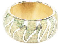
HANA Embellished bangle made from woven raffia in mint green Wholesale : $58 Suggested Retail : $115 SKU 13GR5-B-5 HANA