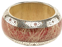
BALI Embellished bangle in coral and palm fiber Wholesale : $58 Suggested Retail : $115 SKU 13GR5-B-4 BALI