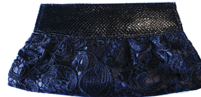
Black Snake Skin Band, Black Lace w/ Black Satin Lining H 13.5 cm x L 30 cm Wholesale Price: $150 Suggested Retail Price: $300 14RJ4-C-26 AUDREY