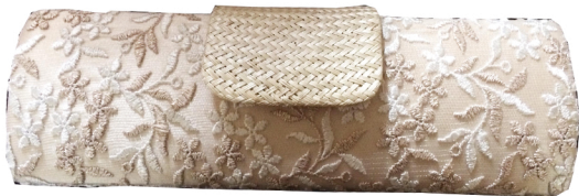
Lace Embellished Clutch, Resin Casing w/ Woven Buntal Flap Wholesale Price: $137 Suggested Retail Price: $275 14RJ4-C-24 MARIE