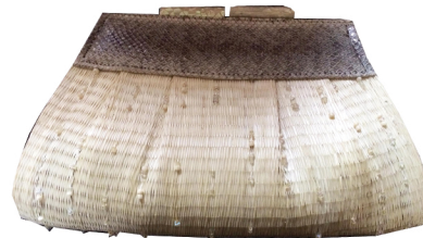
Woven Beaded Buntal Clutch w/ Snake Skin Band & Cracked Shell Lock H6" x L9.5" x W1.5" Wholesale Price: $148 Suggested Retail Price: $295 14RJ4-C-22 INEZ NATURAL