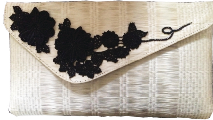
Woven Buntal Clutch, Natural Lace Embellished Wholesale Price: $140 Suggested Retail Price: $280 14RJ4-C-21 SHARON