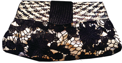
Woven Zig-Zag Clutch w/ Woven Buntal Flap, Lace & Satin Embellished H 13.5 cm x L 30 cm Wholesale Price: $175 Suggested Retail Price: $350 14RJ4-C-20 LIZ