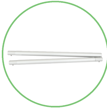
QTY 1: Bottom Horizontal Tube Set

Outside Dimensions: • 48 1/2" W x 12 1/2" H x 6 1/2" D Inside Dimensions: • 48" W x 12" H x 6" D